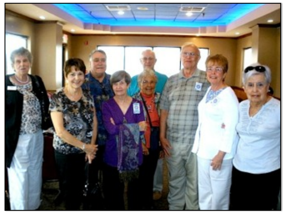
Region One Florida Gathering Picture above and below _ They came, they saw, and they ate Chinese!