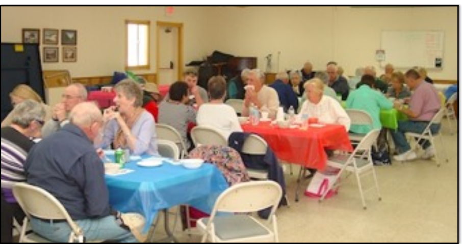
Pot Luck Soup at Travelers Rest - Hey- they came, they saw, they ate soup...