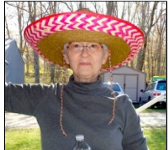
It appears the Margaritas were flowing at the May rally...