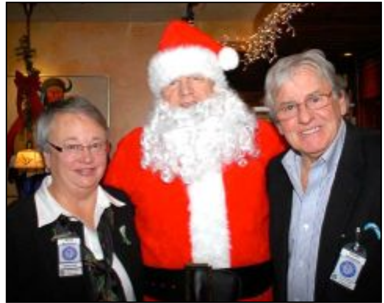
Thanks for the pictures Gilles.