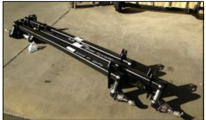
Three good axles.