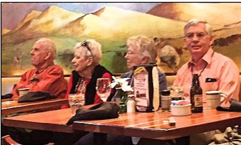
Oh, Oh - someone not paying attention?

But the Holidays bring us the Joy of family and friend - How wonderful that these Good things never never end.