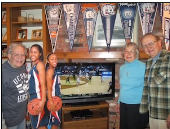
UCONN from page 1

decked out as Gampel Pavilion with championship pennants hanging from the rafters.