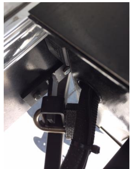
Picture of new bracket