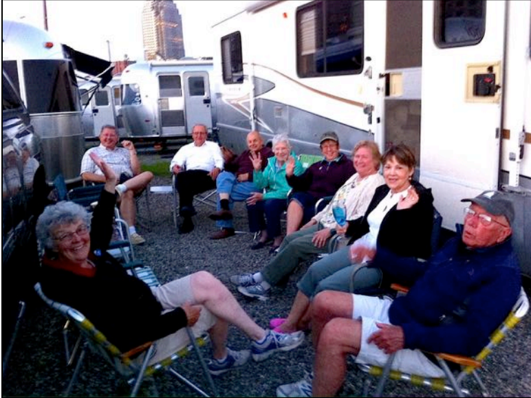
Gathering on the gravel at NY Rally...