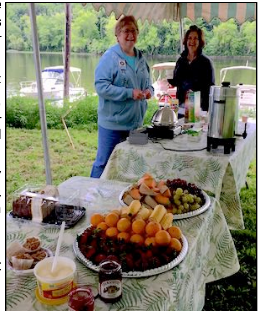
Tasty breakfast for all.

Top Dog Airstream (the Bambi hot dog purveyor) did not disappoint: the best