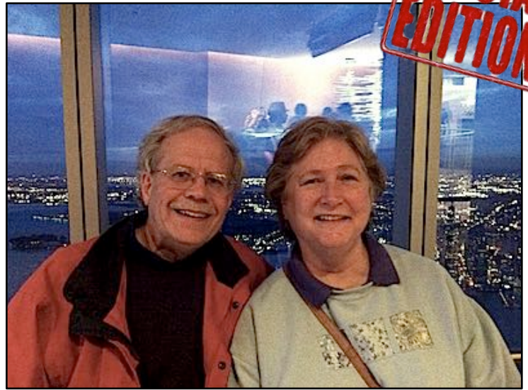
Top of the tower.