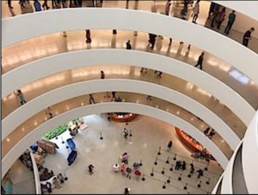
As museums go, the Guggenheim is fun. Elevator to the top and stroll down in amazement.