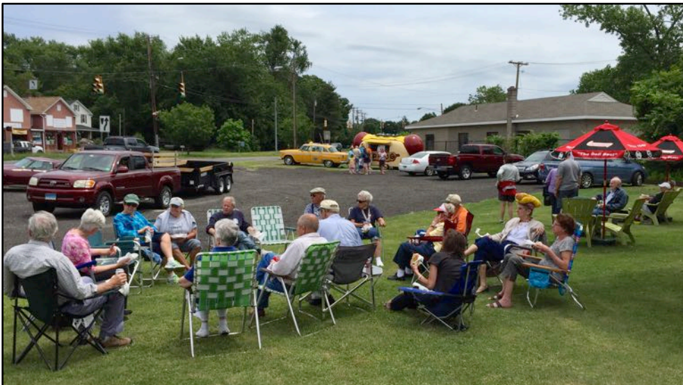
Saturday Lunch at the Dog.