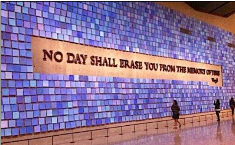
Words to remember.