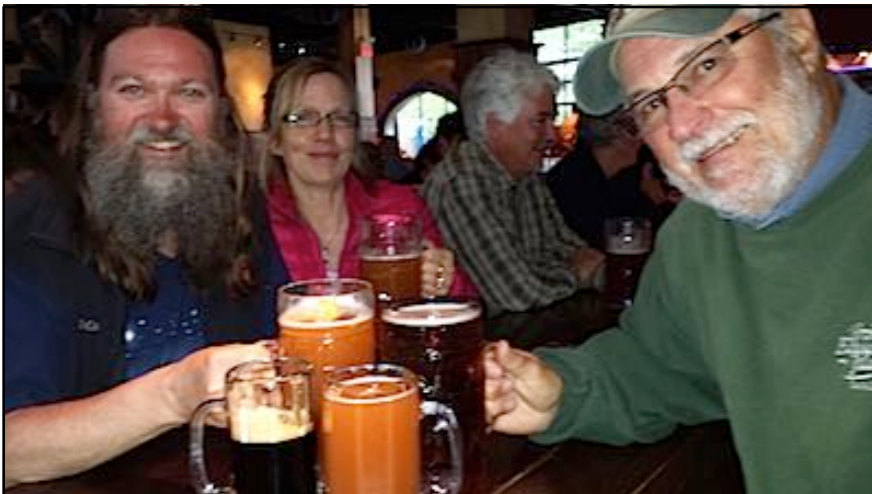
Fun beer hall a short walk away.