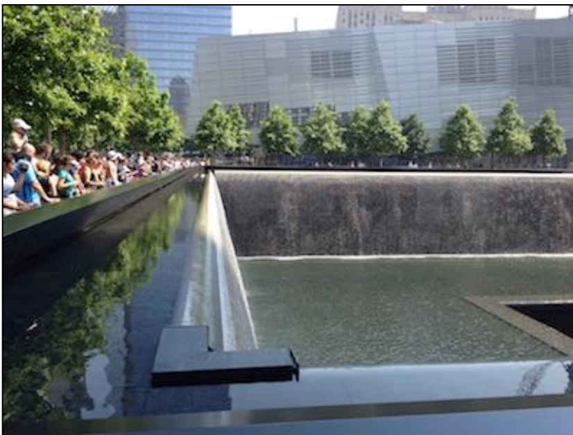
The Pools & the Tower.

We enjoyed visiting "Eataty" located at 200 5th Avenue in NYC. It resembles a great food court with a variety of quality Italian foods and selections. There are 7 restaurants including the micro-brewery on the roof top, from which you can choose to eat. Each restaurant specializes in different foods such as seafood, vegetarian, pasta, pizza and meats. You can purchase homemade pasta, sauces, cheeses, breads and pastry. They sell Italian beer, wine and even Gelato. We do recommend Eataty as a unique place to shop and dine when in the city. ~