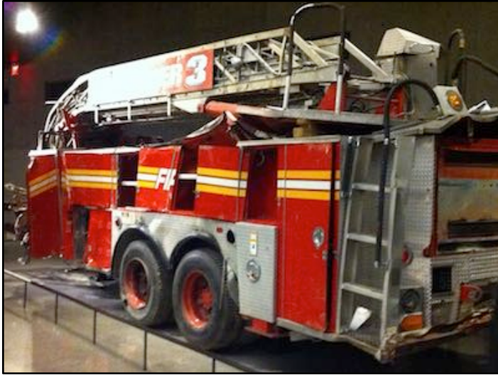
Relic of terror.