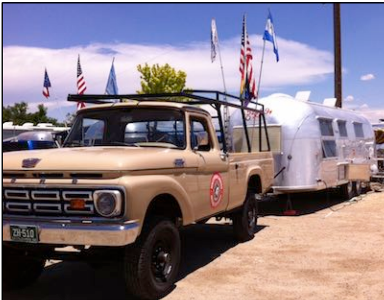
WBCC I - the "I" stands for International.