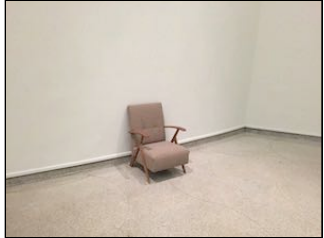
This was titled "Room with Reduced Chair" Who can argue, "A" for accuracy.