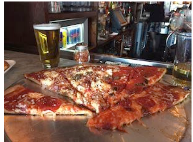
Beer pizza - pizza beer - oh yeah.

For those who want more Airstream events there are several in the area to choose from. To highlight a few: