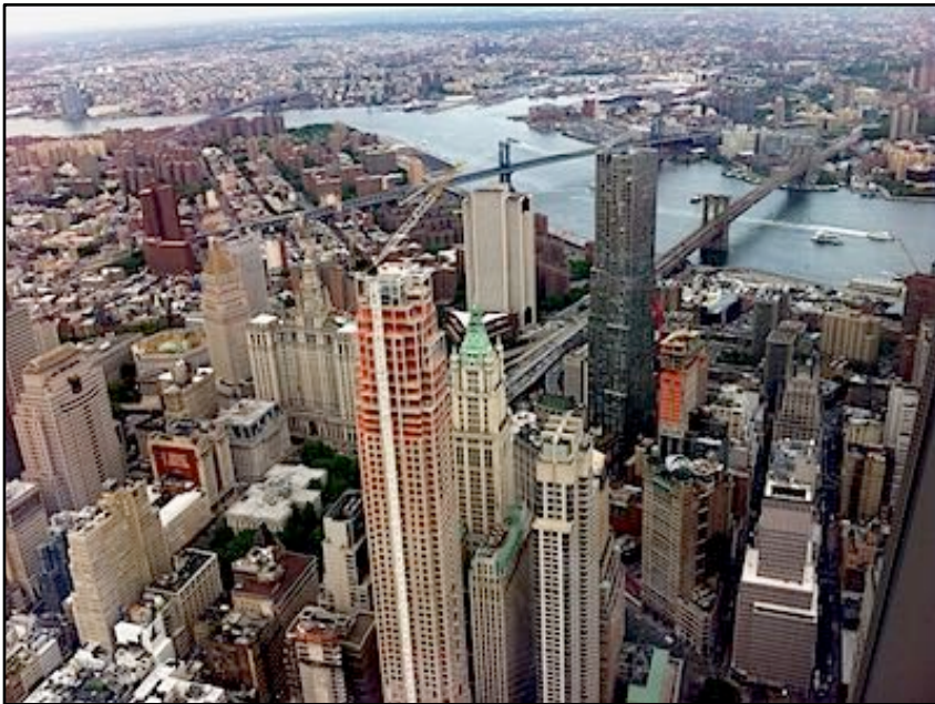
Looking down on the city.

Why a toilet? The tour included a stop at the Morimoto Japanese Restaurant. A rest stop with the highlight being their super toilet. Equipped with several different settings for washing, vibration, heating, and blowing. Curt did have to hurry some of the ladies along, they seemed quite enthralled. ~