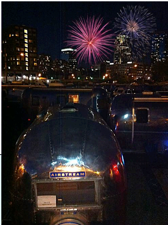
Even fireworks - truly serendipitous.

It was great. We would certainly recommend this rally. The only disadvantage that we encountered was the long walk to the ferry. The group was fun and it was nice to get together at happy hours and breakfasts. ~