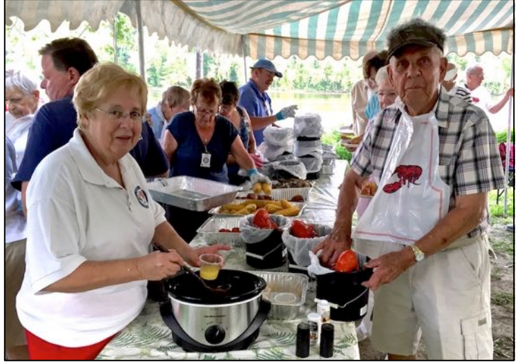
The bib says it all.