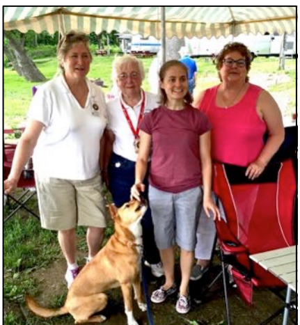
Four gens of Fullers counting grand dog