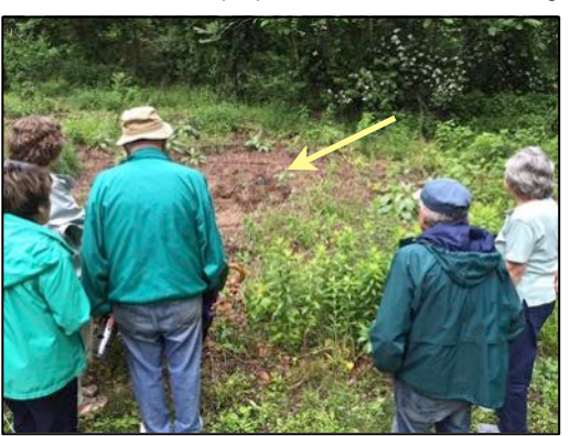
Tough to see - turtle laying eggs then walking away.

To see additional pictures visit the Charter Oak website gallery. http://connecticut.wbcci.net