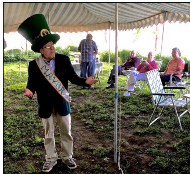
The official Mayor of Charter Oak proclaiming something.

decided to attend the rally. The meeting was followed by the traditional lunch at the Famous Airstream Top Dog, where we feasted on hot dogs garnished with a variety of toppings. YUMMY!