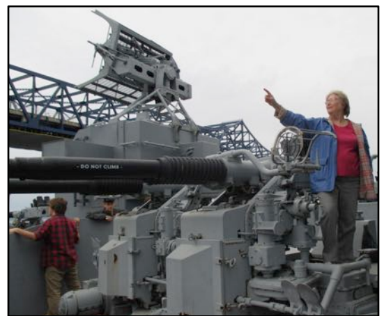
Never argue if the lady has a gun!