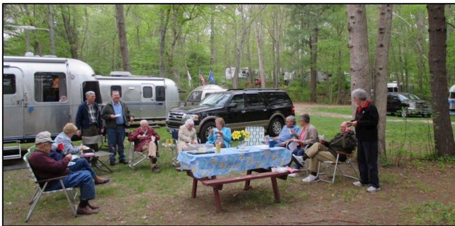
A cozy and friendly rally.