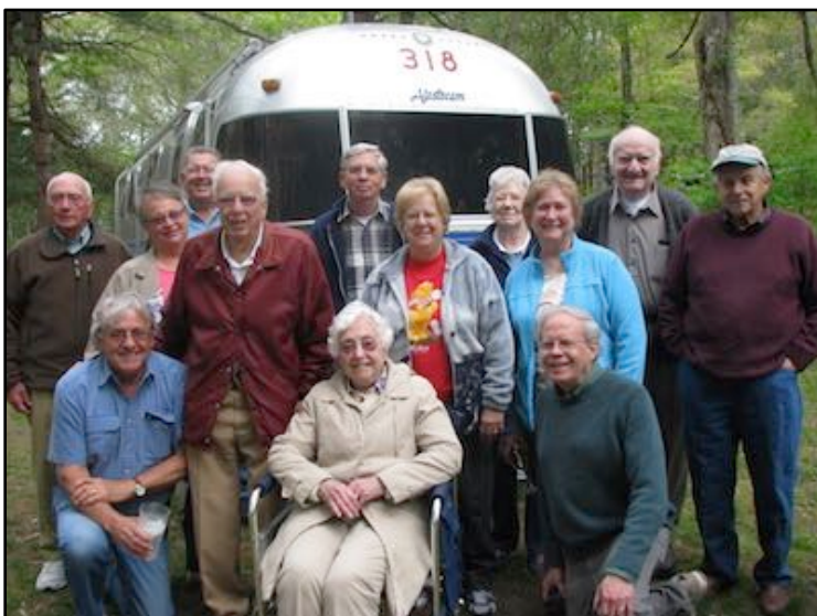
What a handsome group.