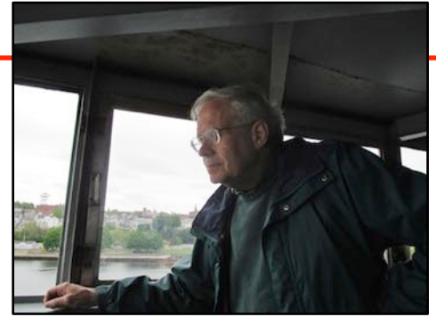
Bard, at the helm...

Westport Camping Grounds was very accommodating and very pet friendly.