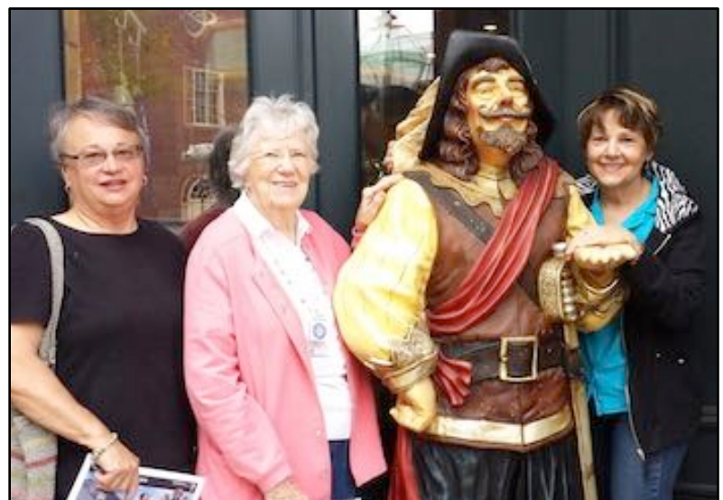
Who is the real Anne Bonney