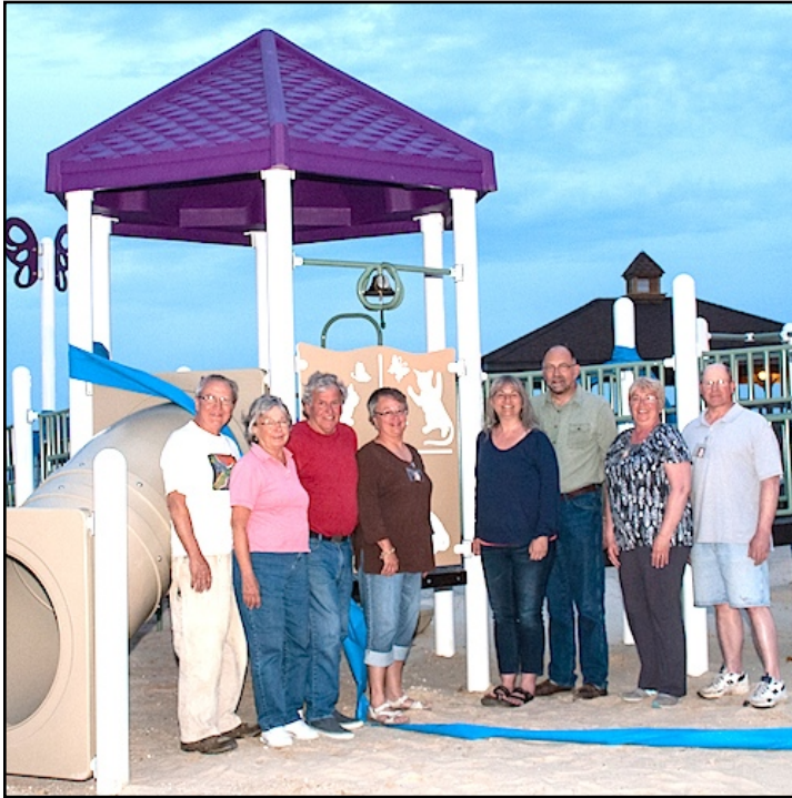
The Airstream group.