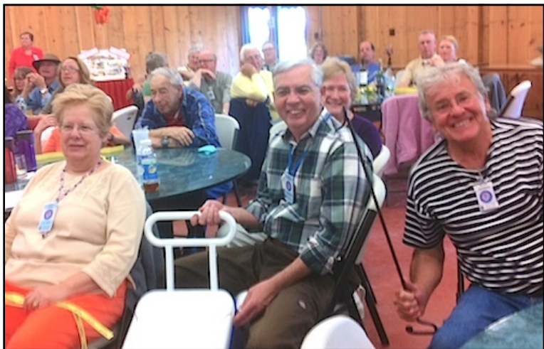
Scenes from the Region One Rally