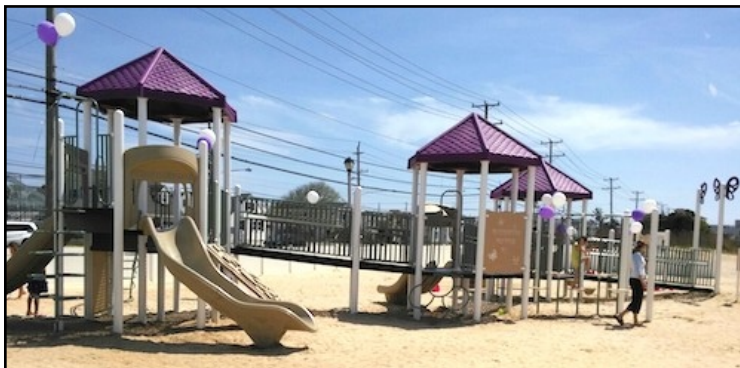
The finished playground