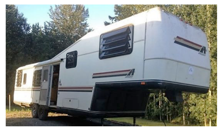
The 1988 fiberglass Argosy 5<sup>th</sup> wheel was white to beige in color. In 1988 WBCCI voted to not accept the Argosy line into its membership.

As a follow up on last month's 1979 aluminum 5<sup>th</sup> wheel prototype Airstream I present here the fiberglass 5<sup>th</sup> wheel Airstream production models.