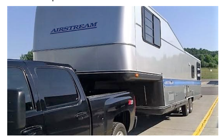
In 1989 the Airstream company rebadged their fiberglass (Argosy) trailers with the Airstream name and painted them all silver, thus side-stepping the WBCCI ruling.