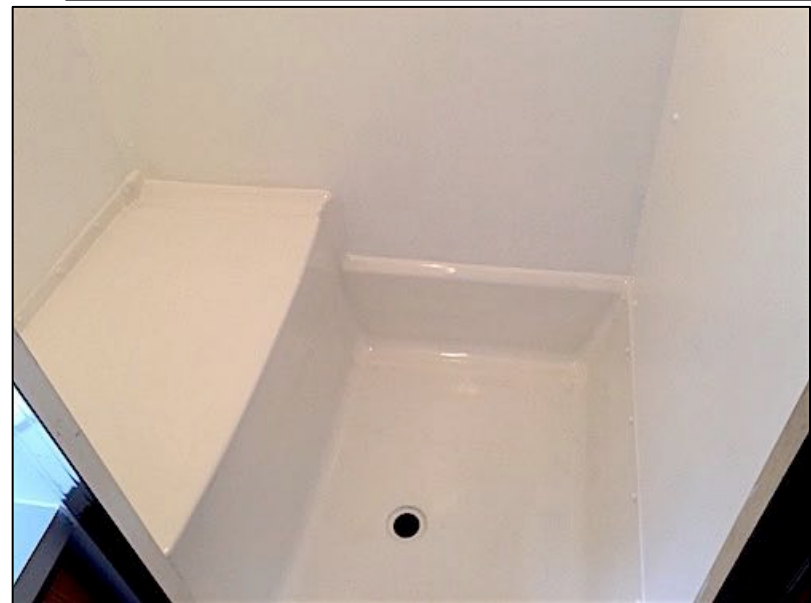
I know I'm looking forward to following this project to completion!