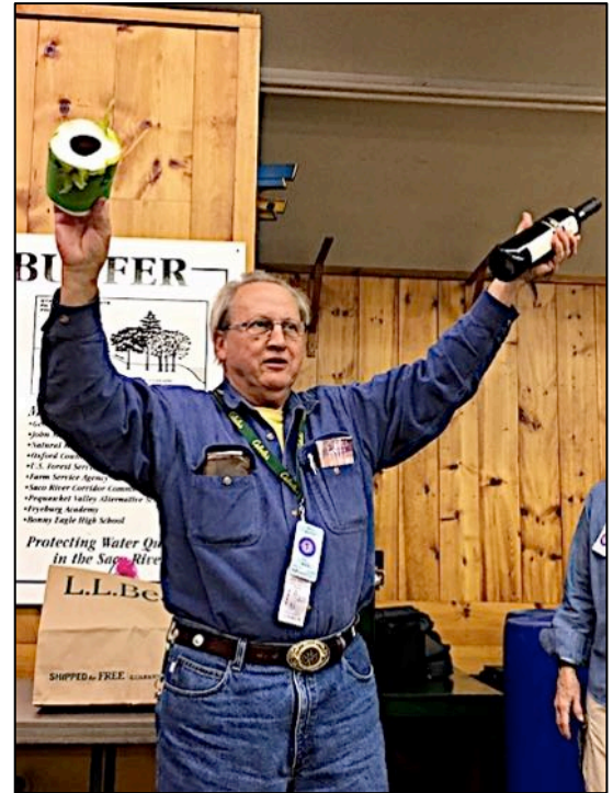
Food, wine, and being prepared.