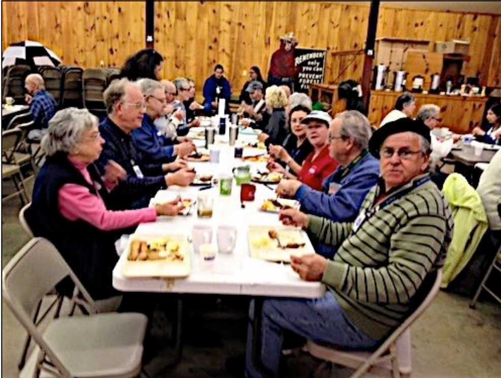
Familiar scene for any Airstream gathering - sharing good food.