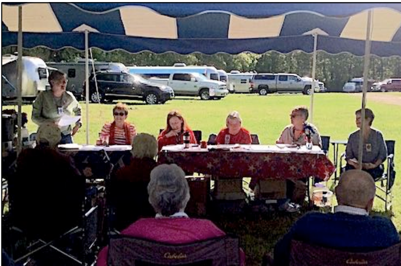
Business was nicely conducted.

The bonfire afterwards was nice, our circle was wide and warm and welcoming. ~