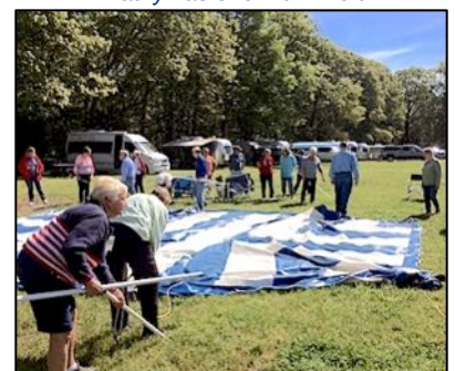
... and the tent came down.