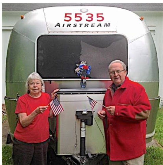
Mystic was red, white and blue with theme flowers for all.