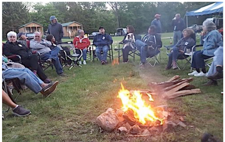
Good fire - good friends.