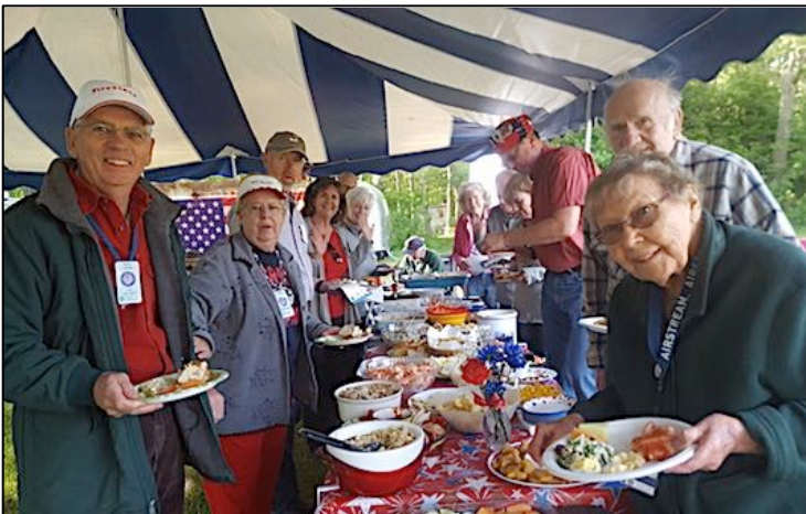
Smiles mean good food.