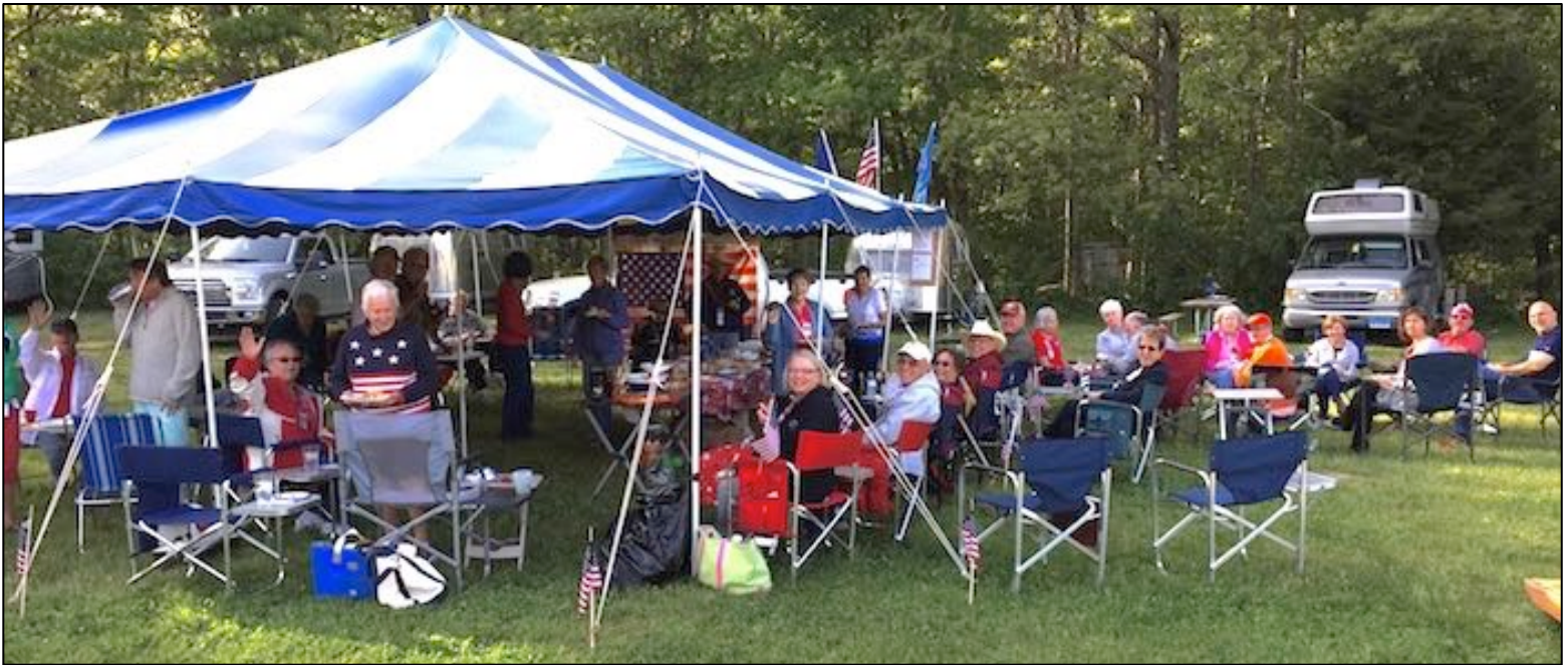
Happy Hour at the Mystic rally.