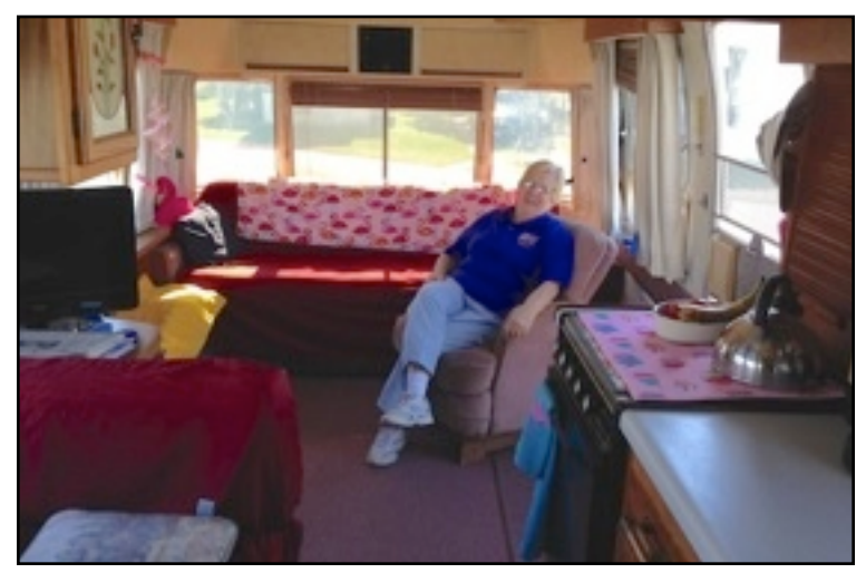
Ok, rest for now!