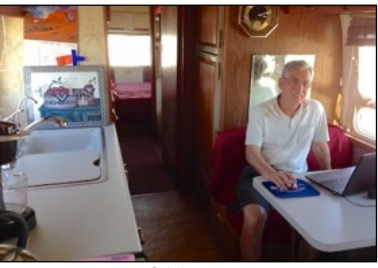
Ordering more parts.