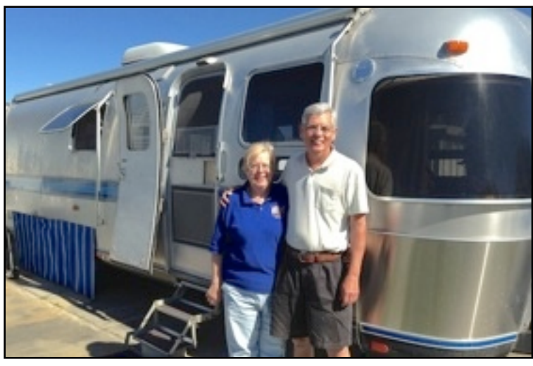
Home sweet home.