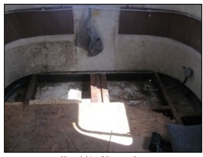
You might call it renovation.