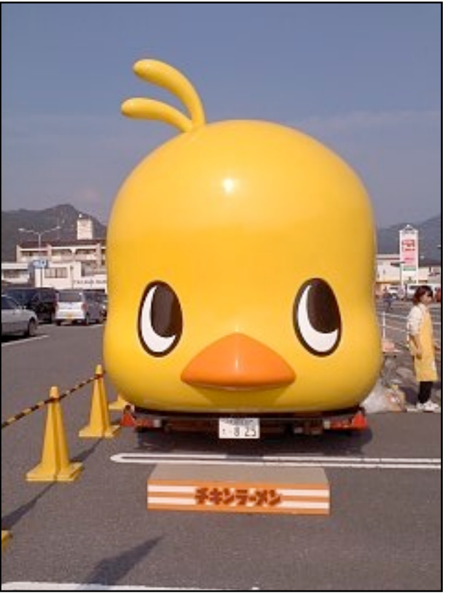
From Bard's collection of "Good, Bad, and Bizarre Airstreams".

Selling chicken just south of Hiroshima, Japan. Check out the fried egg hubcaps.