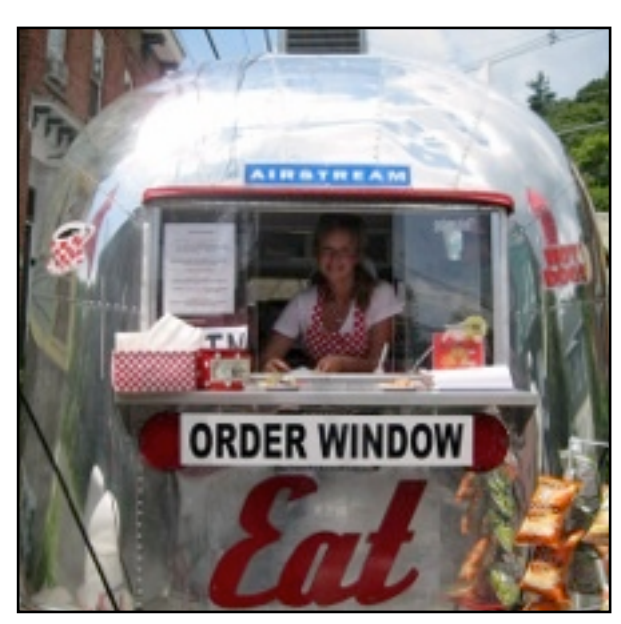
I believe I can say the large red sign on this Airstream is superfluous. ~ Ed.

Selling chicken just south of Hiroshima, Japan. Check out the fried egg hubcaps.