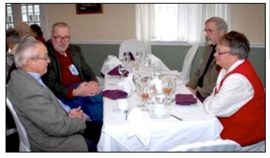
There was a February luncheon - they braved the weather.