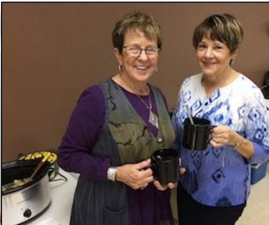
Connecticut soup day in Florida.

Only the pure of heart can make a good soup. ~ Ludwig Van Beethoven