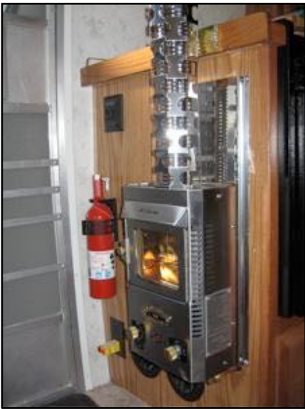
To the left is the very popular Dickson Newport Fireplace.