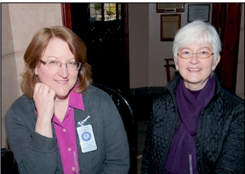
Good food makes for pretty smiles.