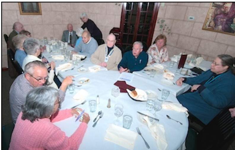
We ordered off the menu and our lunches were made "to order".