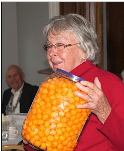
The perfect gift - Priceless!