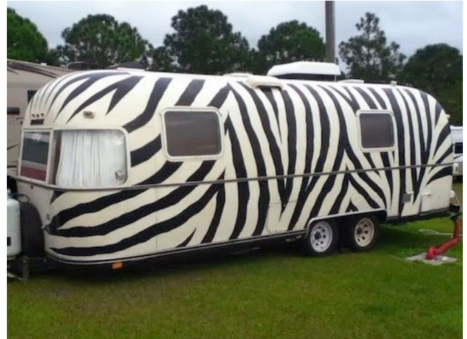
The "Zebra" formerly from Tennessee, now recently acquired by a family in the Carolinas.