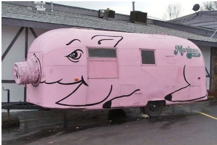
The "Pig" found in Nashville, Tennessee.