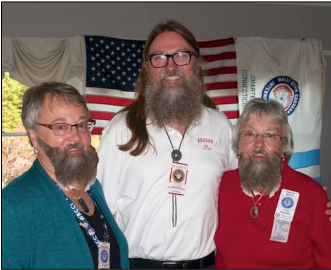
After the installation - Hamnqvistized