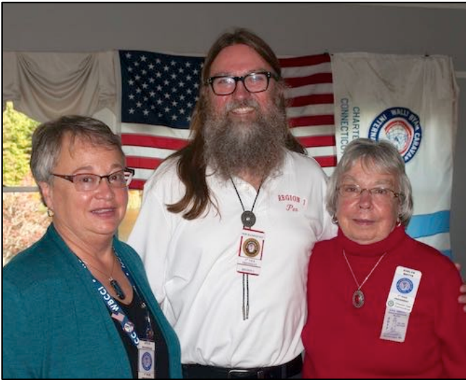
Before the installation.