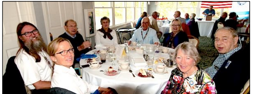
You know who you are. Charter Oak Connecticut installation luncheon.