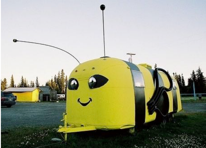
The "Bubble Bee" found outside of Homer, Alaska.

Here are some of my favorite animal Airstreams: