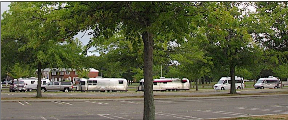
Room for many more.