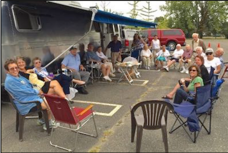
Happy hour at the beach.