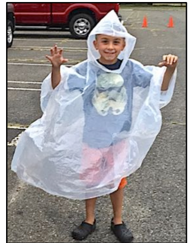
Some rain came but Trent was ready.