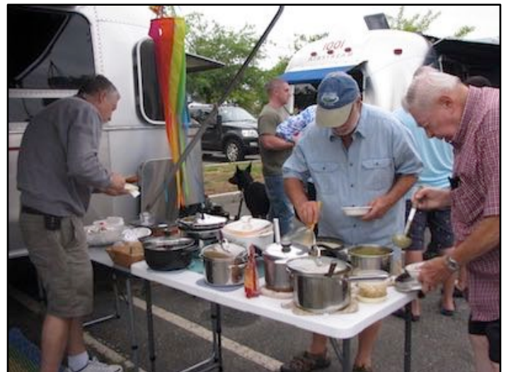
Delicious selection of soups just before the rain.