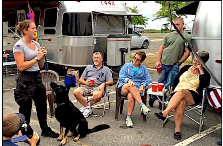
Zeus is a special $8,000 dog and even has a bullet proof vest.