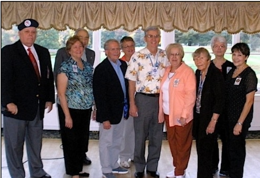
The new ruling class.