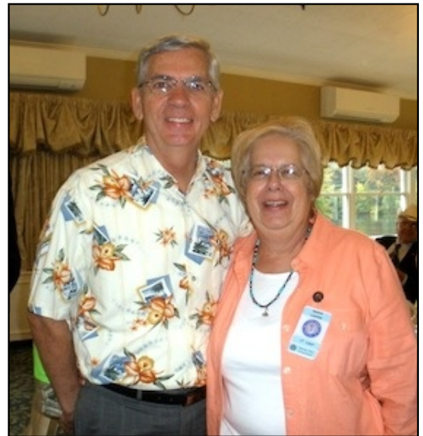
OK - Get your presidents message ready.

A committee is a group that keeps minutes and loses hours. ~ Milton Berle