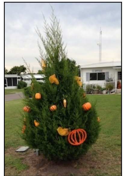
YUP - Halloween Tree Travelers Rest - Florida