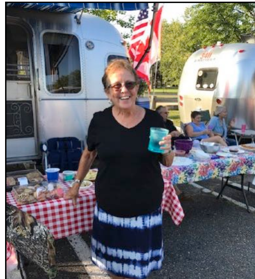
Happy hour, Happy camper - Happy wife, Happy life!