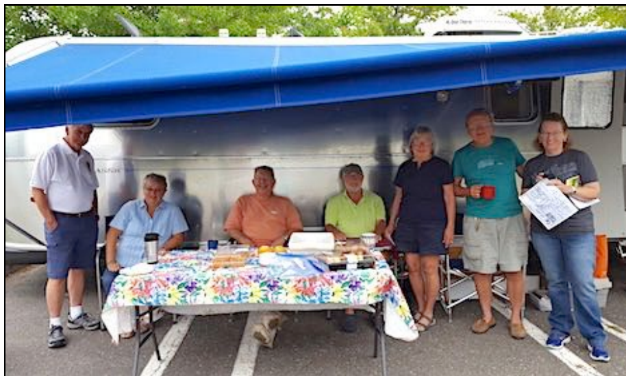
Hey - everyone look at the camera and smile.