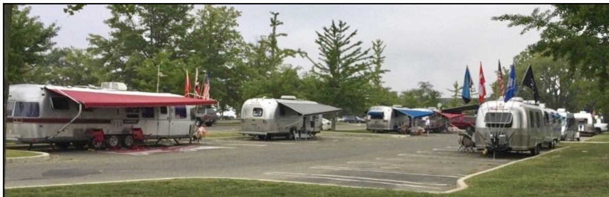
Rendezvous at the beach - Milford Connecticut

In closing, I would like to thank everyone for their support during my time as President. I am uneasy mentioning individual names because I do not want to overlook or offend anyone. So many of you pitched in, on the front lines, the side lines, and the back lines. Your help and support enabled me to enjoy my presidency. I am grateful for your help and friendship.~