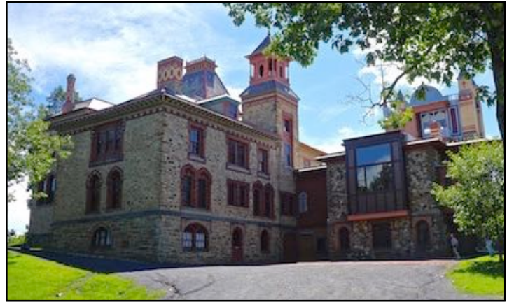
Some visited Olana - a work of art.