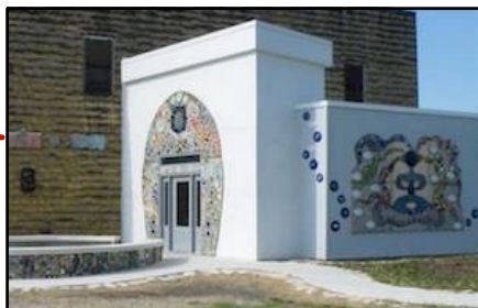
The toilet loser in Lucas Kansas.