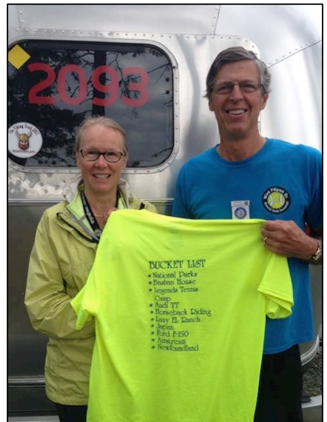
The Fletchers on the Viking Trail.