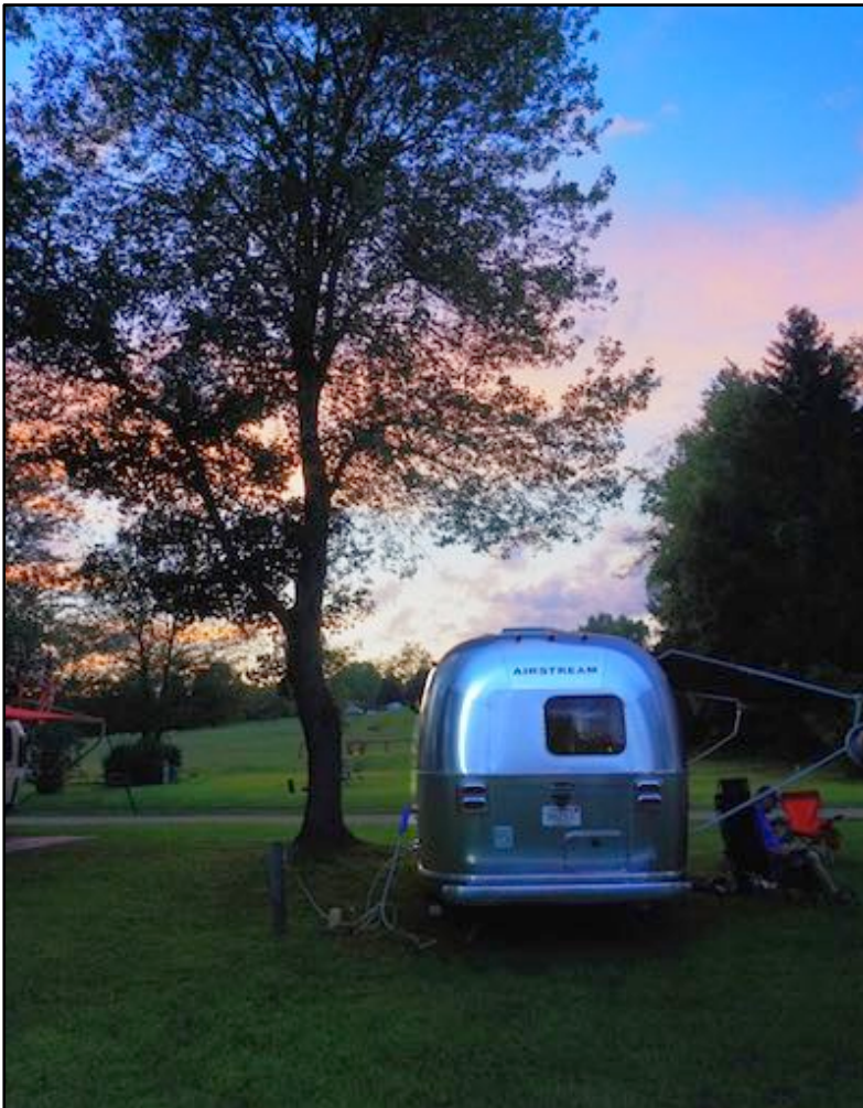
All enjoyed a lovely sunset.