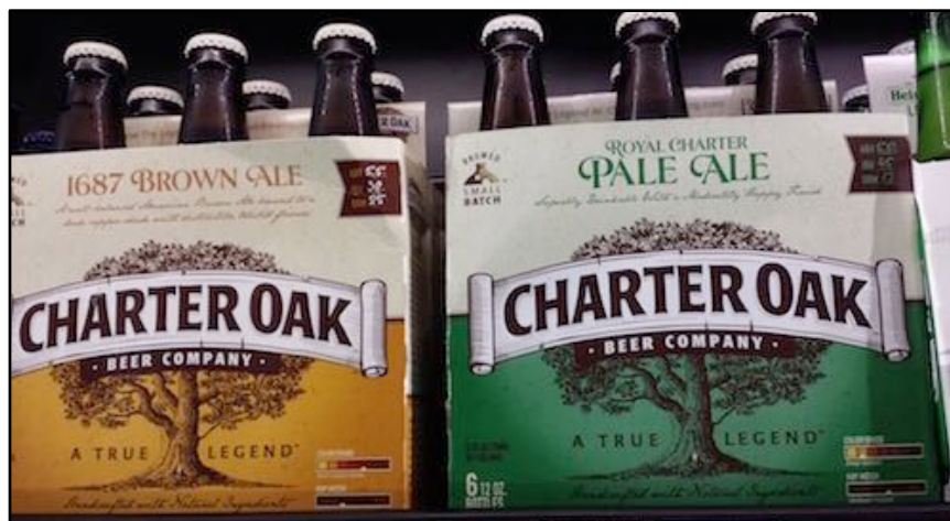
Cools the palette and warms the heart.