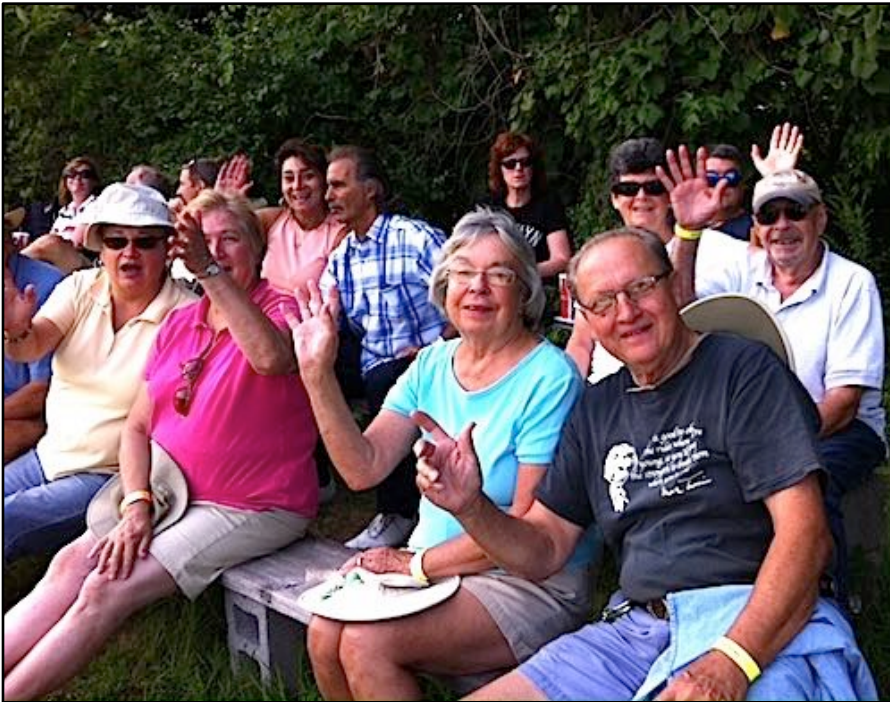
Some watched the air show and continued to wave.