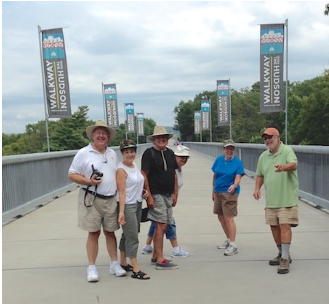
Walking over the Hudson.