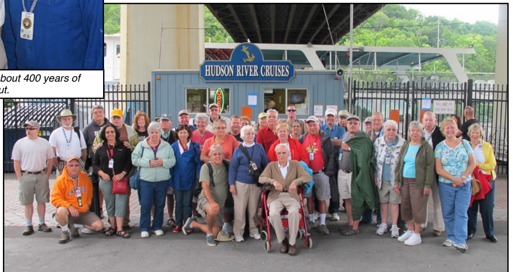
They all went, they all cruised, they all came back.