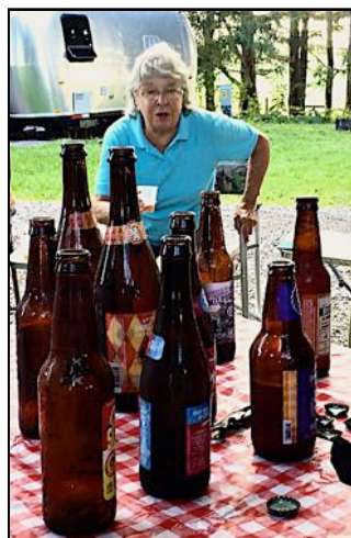
Put the 3 things Billy loves in the correct order.