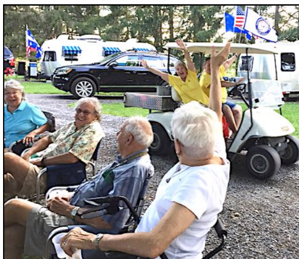
The very friendly KOA hosts and staff come waving by.