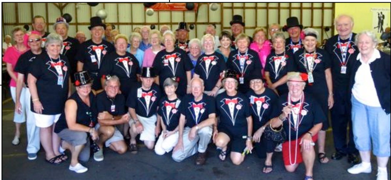
There was a crowd.