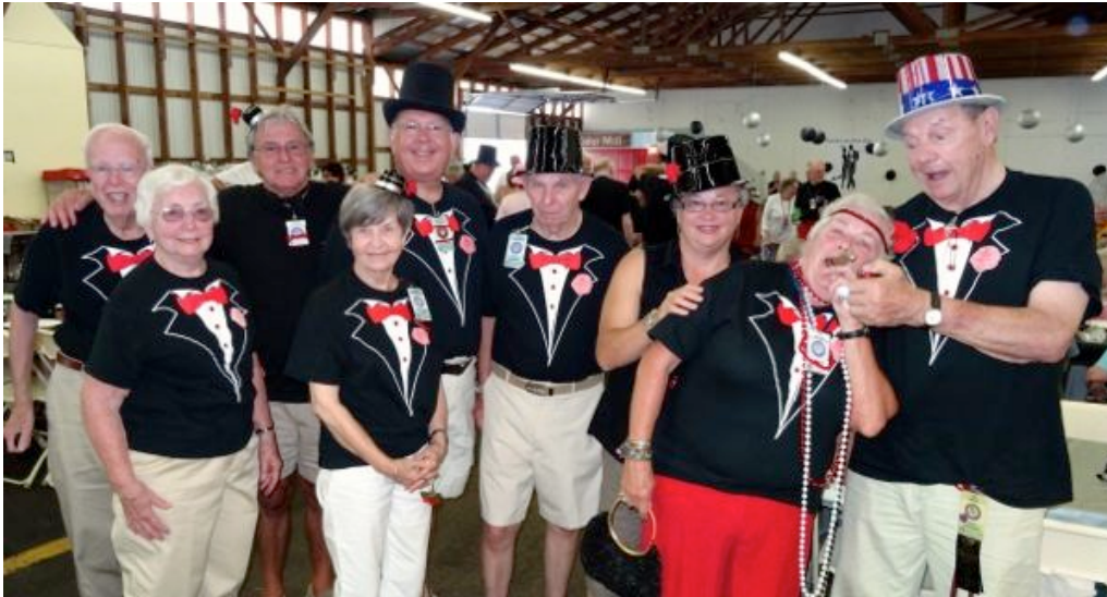
There was horsing around.