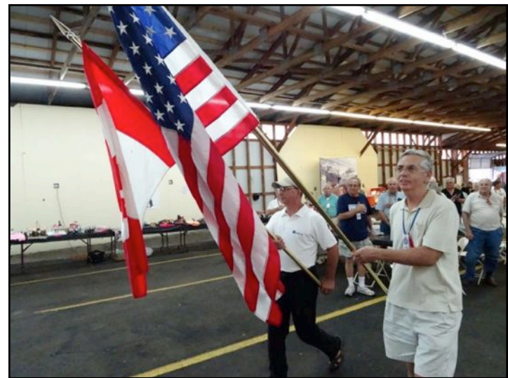
There was a beginning.