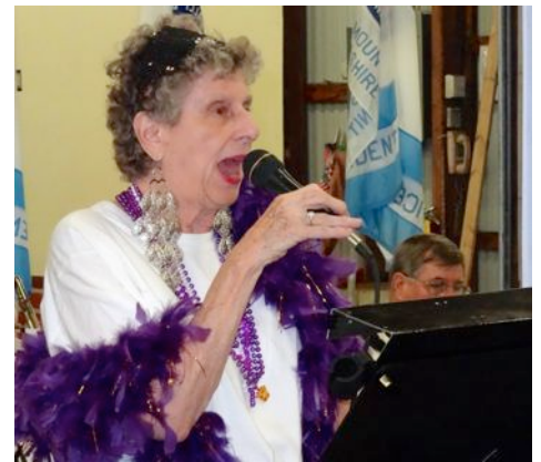
There was a poem.