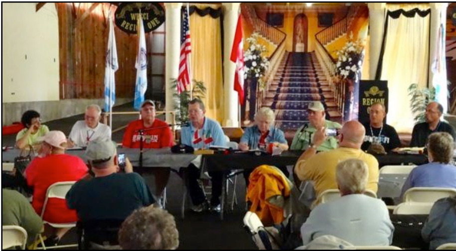
There was a meeting.