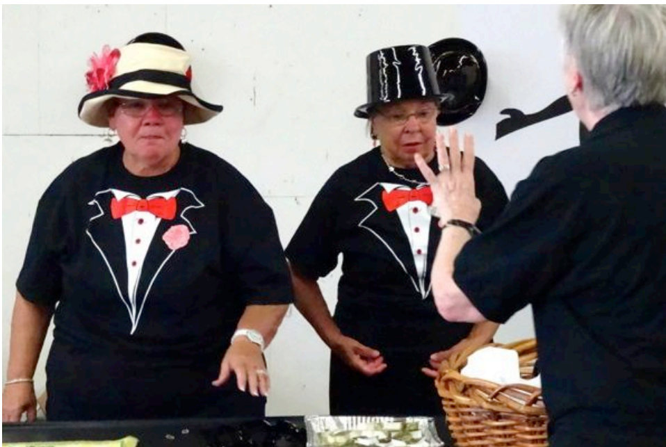
There was control.