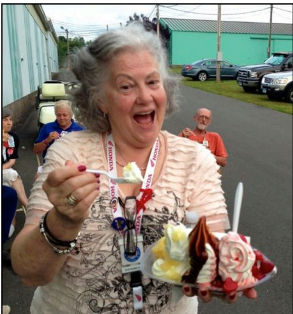
There was ice cream.