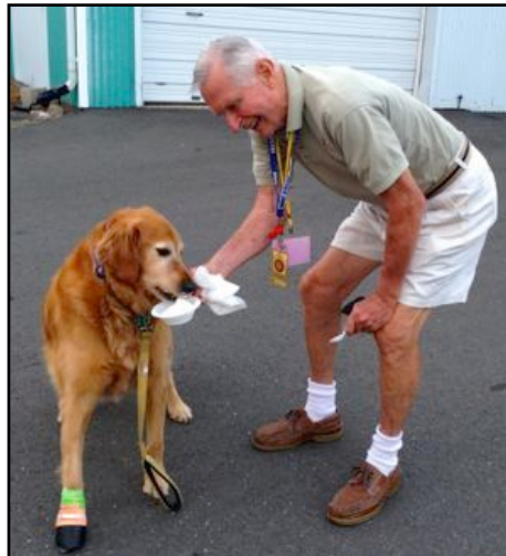
Ice cream for all.