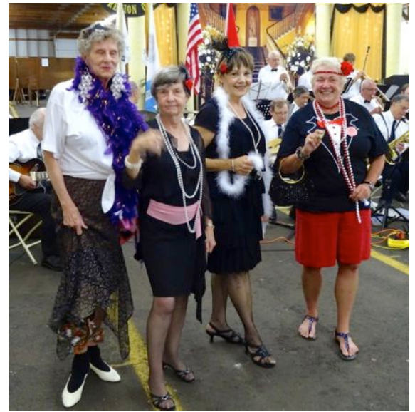
There were those "Gals".