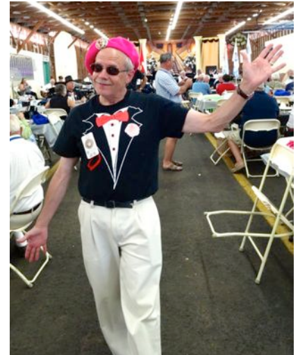
There was the "Man".