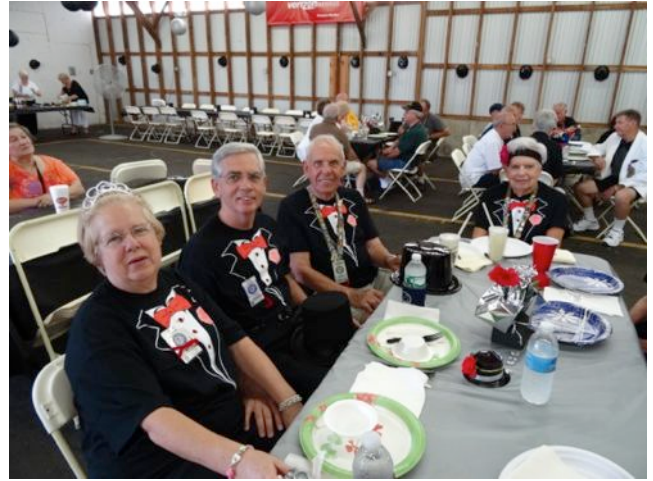
There was posing.