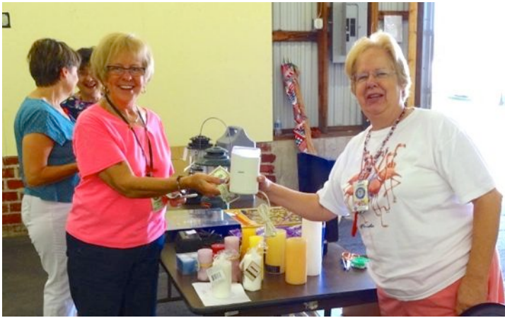
There was a flea market.