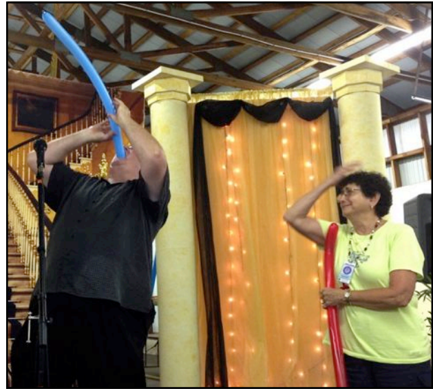
There was wonderment.