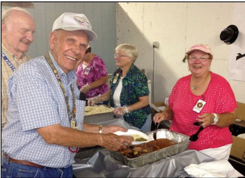
There was food.