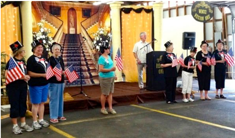
There were announcements.