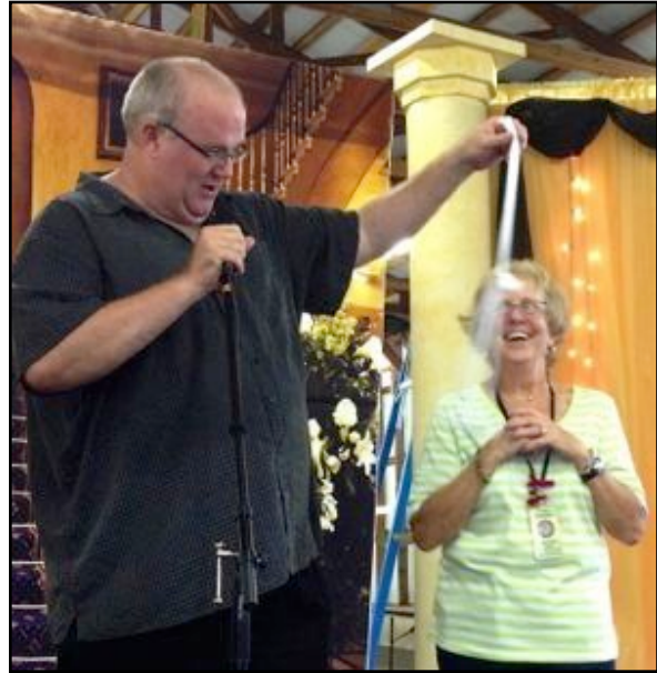
There was magic.