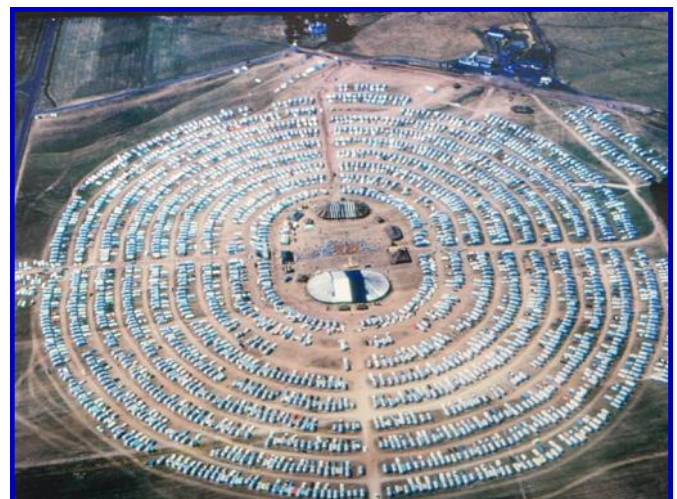
1964 Princeton, NJ Rally