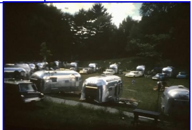
Prospect Lake Rally in North Egremont, MA Hosts: Fred & Lorraine Holzman