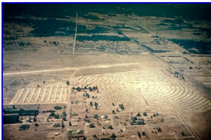
1966 Cadillac, MI Rally