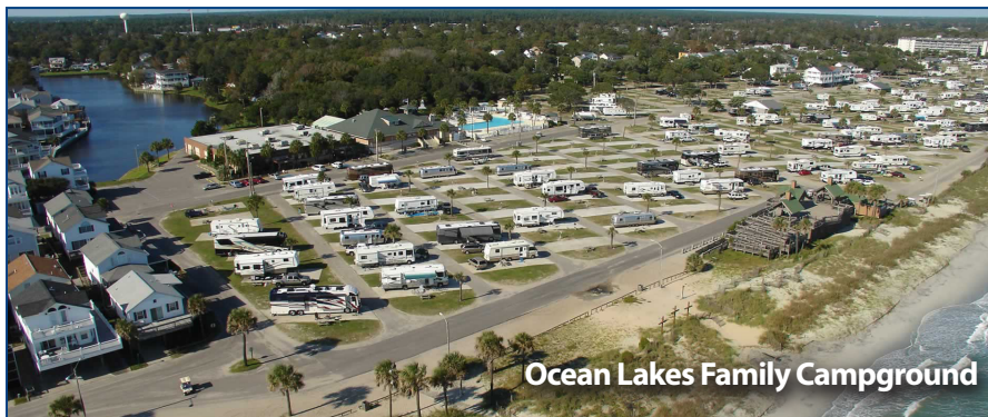
Ocean Lakes Family Campground

Many NORVA couples are attending this rally. Will you be there?