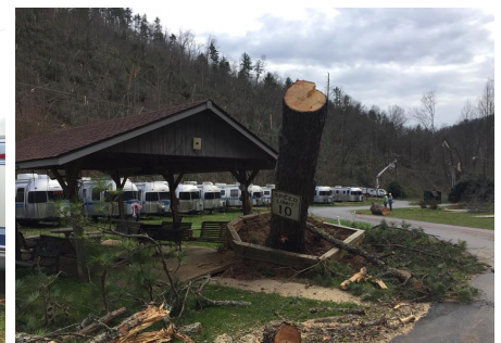
show storm damage to the park.