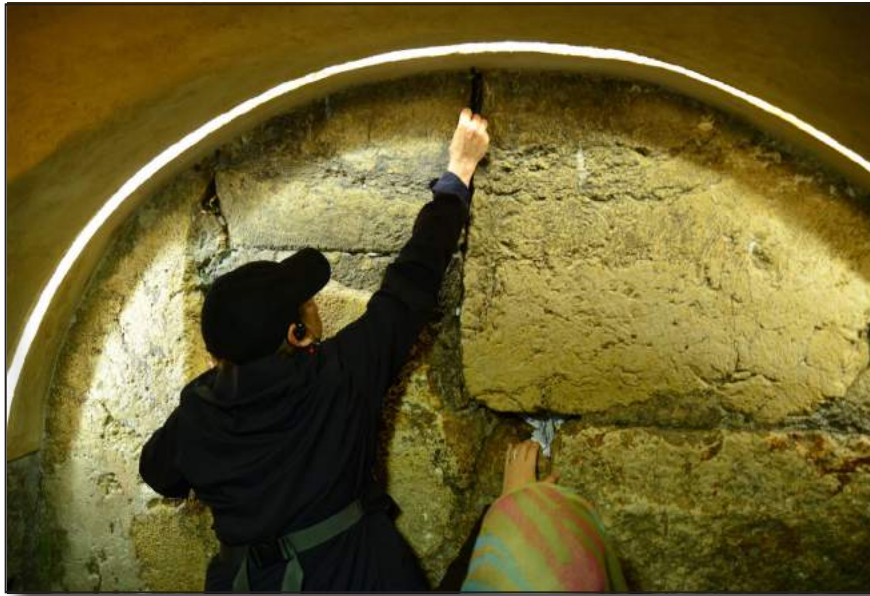
Clockwise from above:

Cathy inserts a scrap of paper containing a prayer between remnant limestone blocks of the Second Temple's western wall, Judaism's holiest site. The Temple existed from 530 B.C. to 70 A.D., when the Romans destroyed it during the Jewish Revolt.