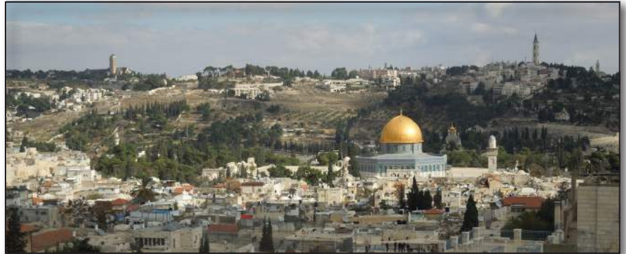
Above: The Old City of Jerusalem and the golden Dome of the Rock as seen from the Tower of David.