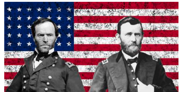
William T. Sherman and Ulysses S. Grant. Bad guys, good guys, or two soldiers operating under difficult circumstances?