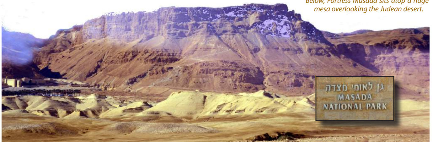
Below, Fortress Masada sits atop a huge mesa overlooking the Judean desert.