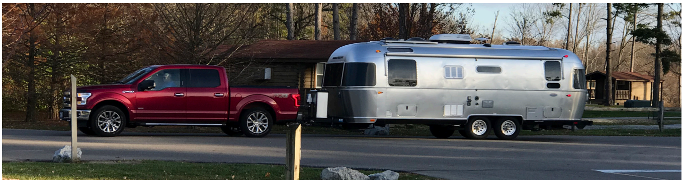
The Nagels head for home.

After our trailer was moved back to the Terraport that evening, we went to the Inn Between restaurant in Botkins, Ohio, where the chicken dinners are legendary. After returning to Terraport, Gerry was out emptying the gray and black tanks