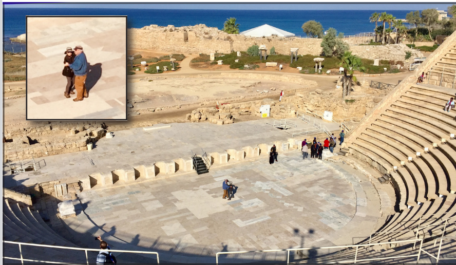
Left (and inset): In Caesarea, Paul performs an impromptu waltz with Cathy, center stage, in a 2,000-year old Roman theater.