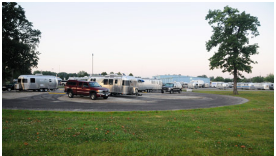
The "Terraport" at the Airstream factory in Jackson Center, Ohio, has level pads with hookups for 24 rigs.

In the meantime, we drove around the area and took the Airstream factory tour. It was a wonderful tour that lasted for about an hour and a half, with an add-on to see the building