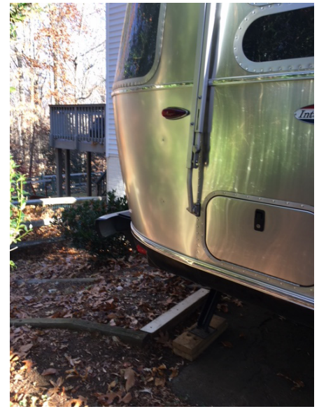
Aahh! The repair is sweet!

manage a few hours with our new Airstream friends who were most hospitable and gracious in sharing Airstream knowledge with the new campers that we are. Our only regret is that we did not have more time to spend with them.