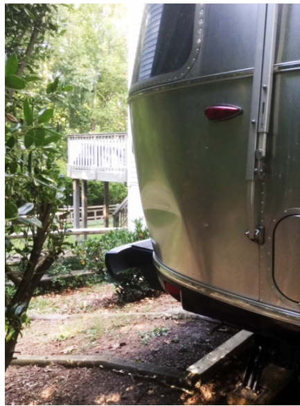
Ouch! The dent is obvious.

The next two days we spent most of the time with cousins but did