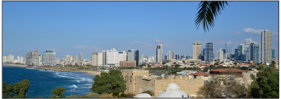
Modern Tel Aviv stretches northward along the Mediterranean coast in this view from Jaffa.

A poignant moment happened on Day One of our tour, when we sat on the original wooden folding chairs in a modest building in Tel Aviv. In that very room the Independent State of Israel was proclaimed by David Ben-Gurion on May 14, 1948, as the British Mandate ended and after the U.N. voted to partition Palestine between Jews and Arabs. Ben-Gurion served as Israel's first prime minister as the surrounding Arab nations attacked on May 15 in an attempt to wipe out the new country. They failed in 1948, and again in 1967 and 1973. We real-