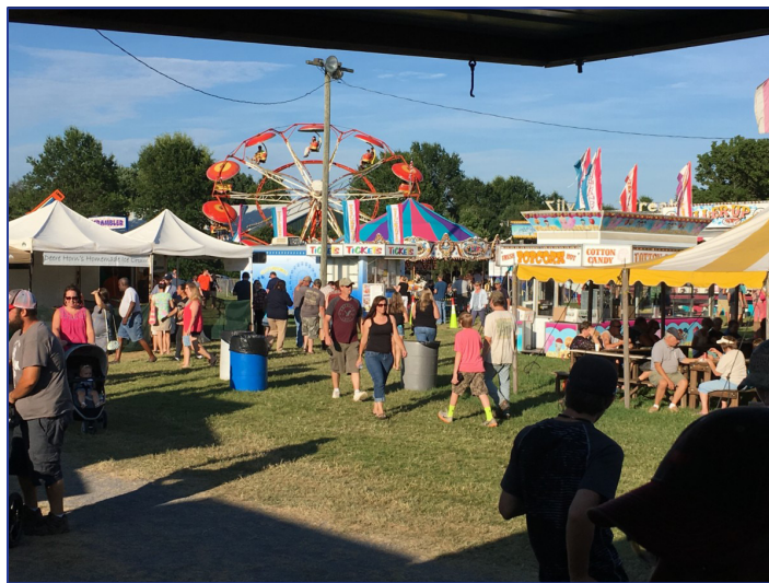
The summer Lawn Party in Bridgewater, Va., is a well-attended event.