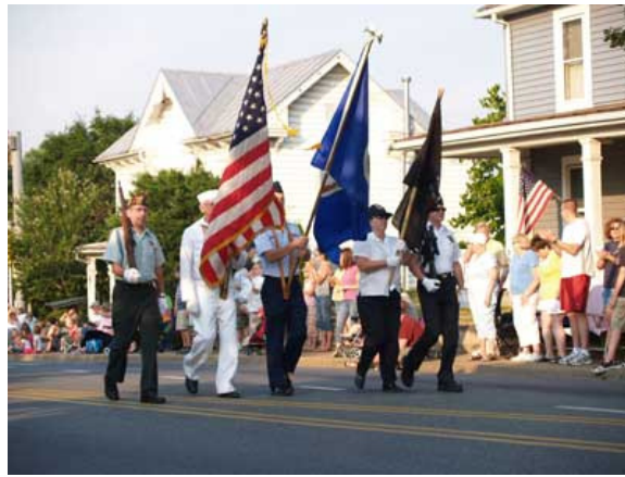
Photos from Bridgewater: Scenes from “Lawn Parties” held in prior years. At NORVA’s Valley Rally this summer, expect to experience parades, good food, and music on the sidewalks and streets of this friendly Shenandoah Valley town near Harrisonburg.