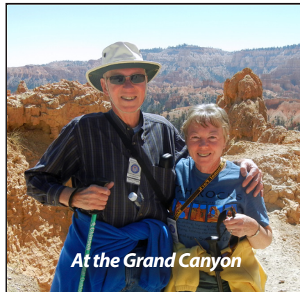
At the Grand Canyon