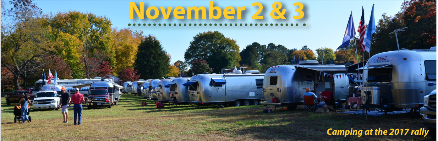
Camping at the 2017 rally

NORVA is again hosting a DRY CAMPING rally in town. Reserve your site now for Nov. 1 to 4