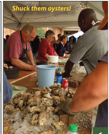
Shuck them oysters!