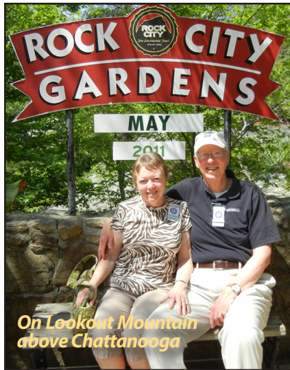
On Lookout Mountain above Chattanooga