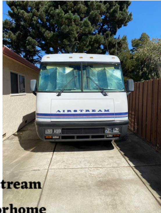
Airstream Motorhome 33' in 2020