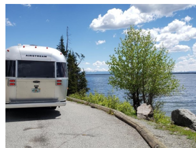
Overlook of Jackson Lake and Grand Tetons, WY