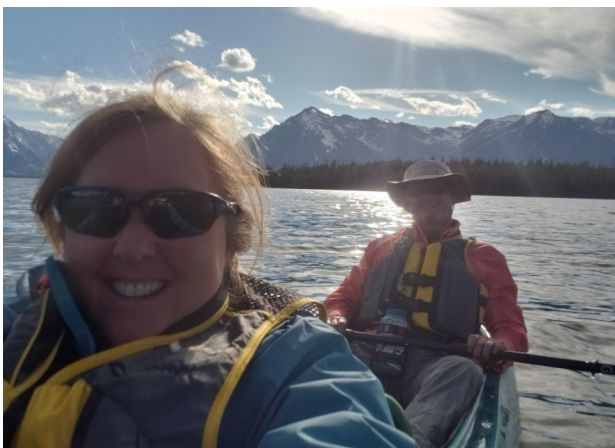
Kayaking in Jackson Lake (Grand Teton NP)

That was the planned stuff and we had a great time!