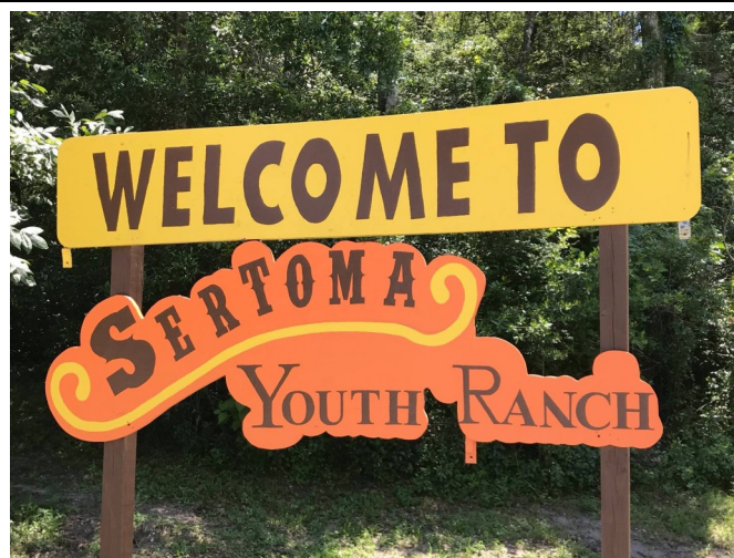
Sertoma Youth Ranch Campground 85 Myers Rd, Brooksville, FL 34602