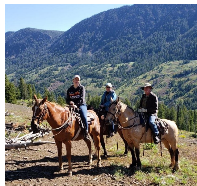
Horseback riding near Yellowstone NP