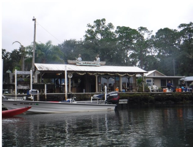
View of Mary's Fish Camp from the river.

If you want to attend but campground is full, leave your name on a waiting list, as last minutes changes can occur.