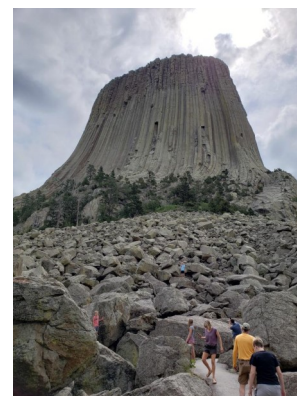
Devil's Tower, WY