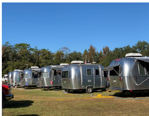
Fort Christmas Rally, 2019

So far, rallies are scheduled for Jan. through April, 2021 (see schedule on page 8). We have room for one or more per month, except we don't plan any during June, July and August.