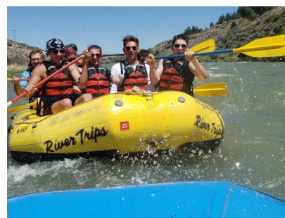
White water rafting in Cody Wyoming