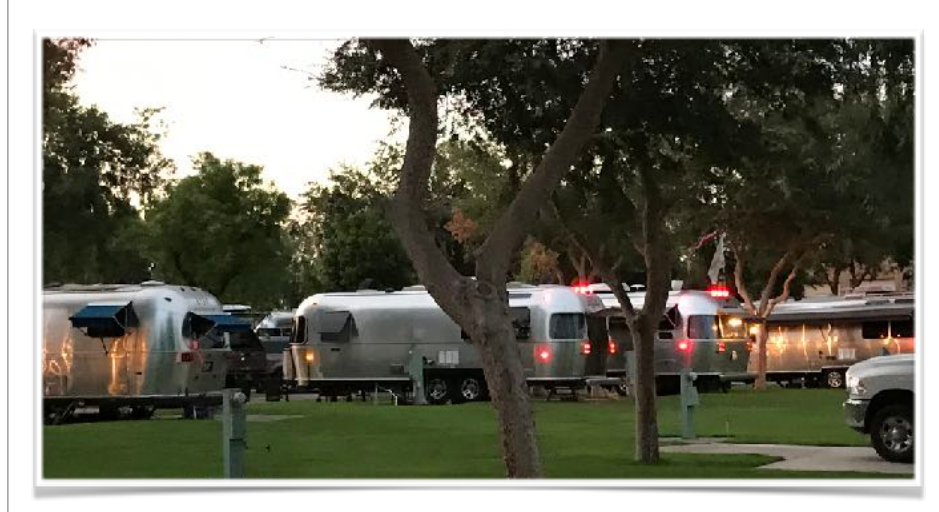
Airstreams in a Row - Region 12 Rally, Palm Desert

October 6-10, 2021 the Region 12 Rally will be held at the all new Cava Robles RV Resort in Paso Robles, California