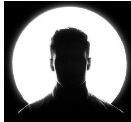
2 nd Vice President: Your picture here!