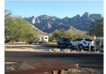
Catalina State Park, AZ