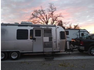
Las Cruces, NM sunset