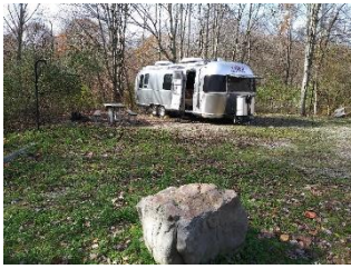
Ohio State Park, PA