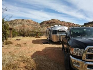
Palo Duro State Park, TX