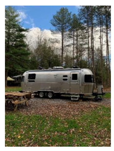
Jansen's (Site 011)