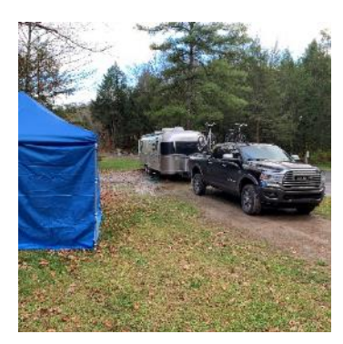
Gibson's (Site 001)