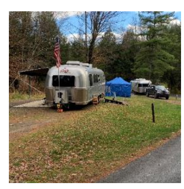
Rossitto's (Site 002)