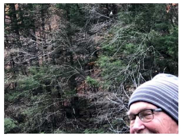
Can You Spot the Bald Eagle?