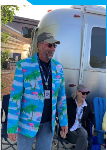
FOLLOW US ON INSTAGRAM

As 2020 disapears in our rear view mirror we have new officers planning exciting adventures for 2021 and 2022. We promiss to keep each other safe and have a wonderful time camping. At our last members' meeting, officers were directed to plan more state park rallies, have glamping oportunities and offer dry camping experiences. Every rally should feature both recreational and educational opportunities.