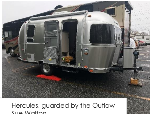
Hercules, guarded by the Outlaw Sue Walton

The trailers were nestled all snug on their planks; while visions of campgrounds danced in their tanks. Not a creature was stirring, not even a mouse (whew!) Happy New Year to all, and to all a good night!