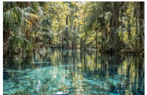
Silver Springs State Park, FL

Try this website if you really want to snatch a site as soon as an opening appears.