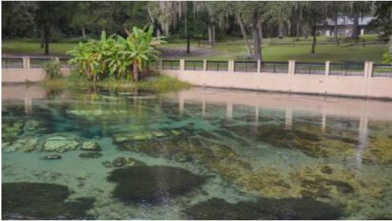
Salt Springs Recreation Area is one the recreational jewels of the Ocala National Forest, with a spectacular natural mineral spring that gives the area its name.

We hope to paddle the Ocklawaha River and explore the forest (there are three other beautiful, accessible springs, a cross-Florida barge canal and Rodman Dam). Bring kayaks, bathing suits, masks and snorkels, bicycles, skateboards, fishing poles, hiking shoes, fire wood. Sorry, no golf carts. There is a boat ramp in the park and a marina to launch your boat or rent kayaks. The Salt Spring run leads into Lake George. Since the spring is a constant 72 degrees, and is shallow, it is always swimmable.