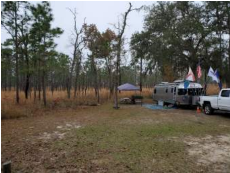
View of long leaf pine and reed grass restoration from Sandhill Loop site.

If the state park is full, then there may be spaces available at Starke KOA , 1475 S Walnut St, Starke, FL 32091.