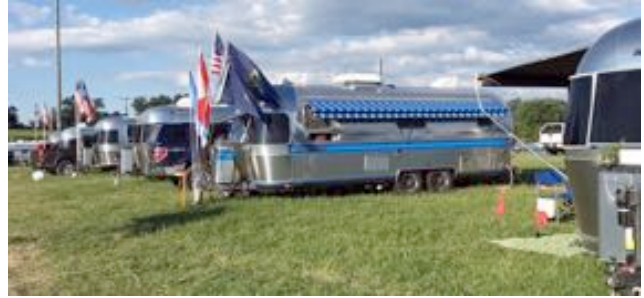
Dick Wheatley displayed our flags at Lewisburg.