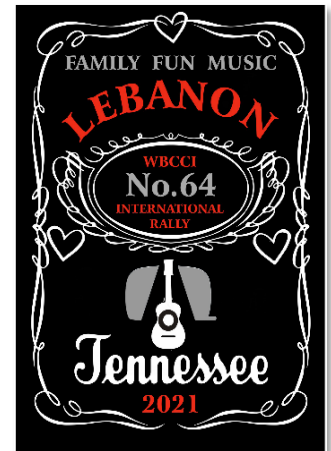
City of Lebanon, Tennessee