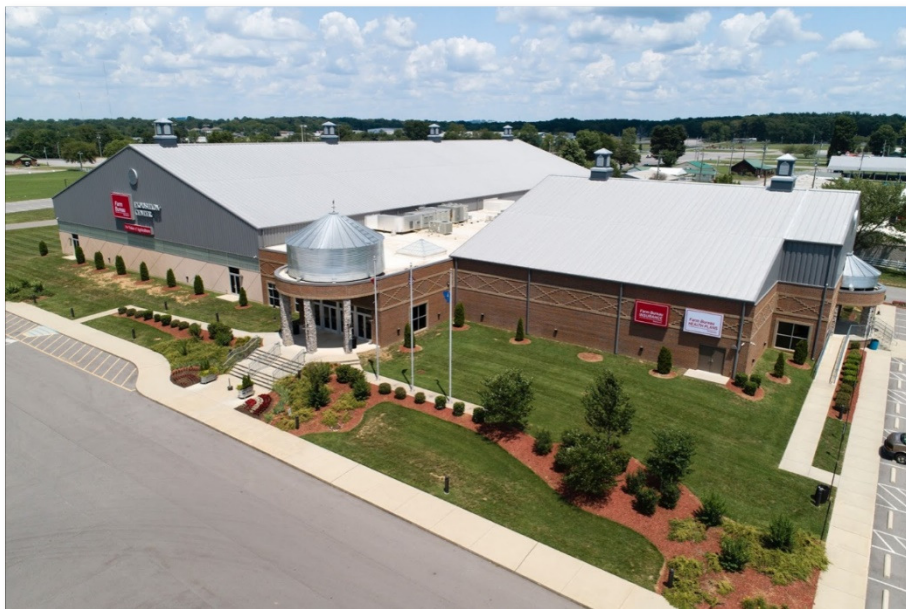
Wilson County Farm Bureau Exposition Center, Tennessee