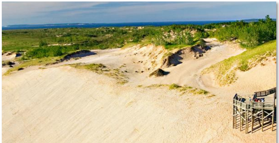
Sleeping Bear Dunes National Lakeshore

Note: There is no rally fee. A 50/50 raffle will be conducted during the rally to cover the club’s costs of the event. Any excess monies from the raffle proceeds may be donated to the Region 4 Charity.