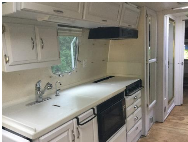
A true transformation, but not finished yet.

The cabinetry is reinstalled. Now for a new backsplash, wallpaper, new vinyl walls and flooring. To be continued. . .