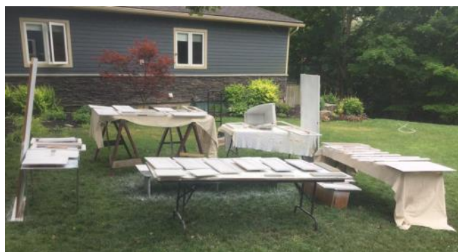
Our yard became our paint shop. Here the primer coat on both sides of trailer cupboards is finished—pretty slick with a spray gun.

We ripped out all the filthy mouse fur. We removed all the cabinetry as Murray meticulously labelled every piece so we knew where it belonged when we were done painting. I