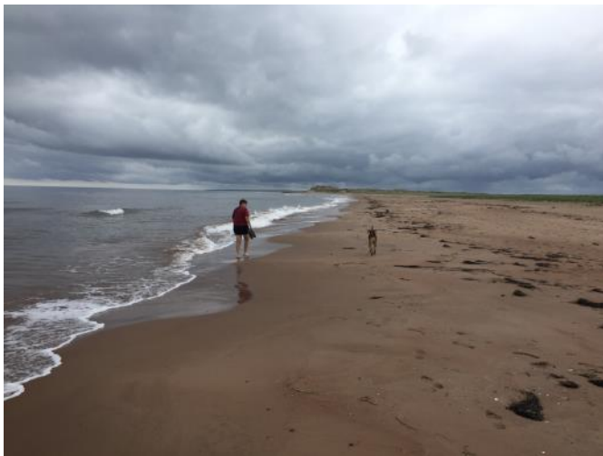
Walking the beach in PEI— August 2019

We drove through all of the Maritime provinces except Newfoundland. We'd have liked to have gone there but the short ferry required us to bring a kennel for the dog and put a muzzle on him. Well, we don't have storage room in the base-camp for a kennel so did not go to Newfoundland. When in PEI, we met some of the most warm and friendly islanders. But we also had encounters with some real nasty ugly people who thought the world circled around them. We actually had to leave one campground early because of them and the