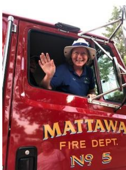
Don't ask! when I firefighter invites me into his truck, how could I say no??

All that changed in March when the full weight of the pandemic became evident and we realized COVID-19 was not going away any time soon. It all became quite real for us as a club when, after almost two years of planning, negotiating, and coordinating, we made the agonizing decision to cancel the Region 2 Rally in Kingston. We then watched in growing dismay and disappointment as over the next weeks and