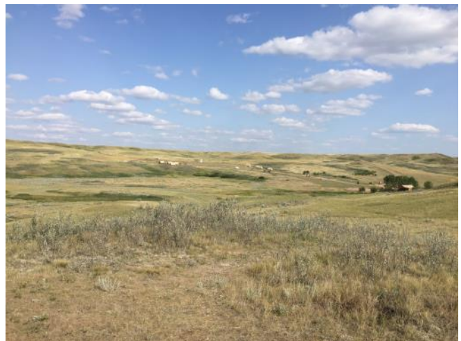
Grasslands National Park— July 2018

When we turned around to come home, we travelled along the back roads near the border of the US and ended up in Grasslands National park. It was here that the dinosaurs, and