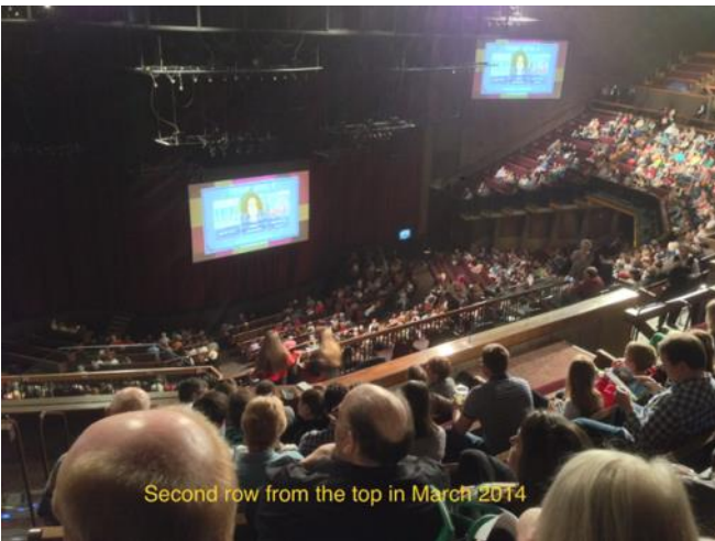
Second row from the top in March 2014

On that first visit in 2014, we learned that there are two styles of Country music: Nashville and Bakersfield. The Bakersfield style is the twangy one, which we still don't care for. Nashville style includes singers such as Elvis Presley and Roy Orbison, Jim Reeves and Waylon Jennings. We went to the Grand Ole Opry and really enjoyed it. We found out you have to book well ahead so you don't end up in the gods as we did.