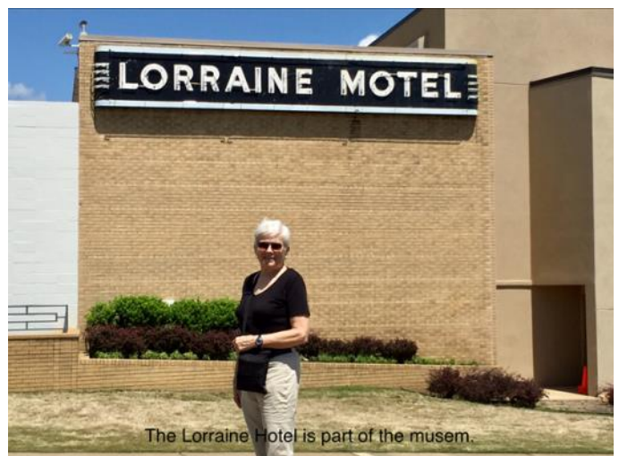
The Lorraine Hotel is part of the museum.

The last day in Memphis, we went to the National Museum of Civil Rights – the highlight of our civil rights tour! The museum was built around the Lorraine Motel where Martin Luther King Junior was shot. The museum began with a presentation on slavery and its importance to the American economy. It took several hours to go through this museum. There was so much detail, a lot of it disturbing. Our tour ended in Martin