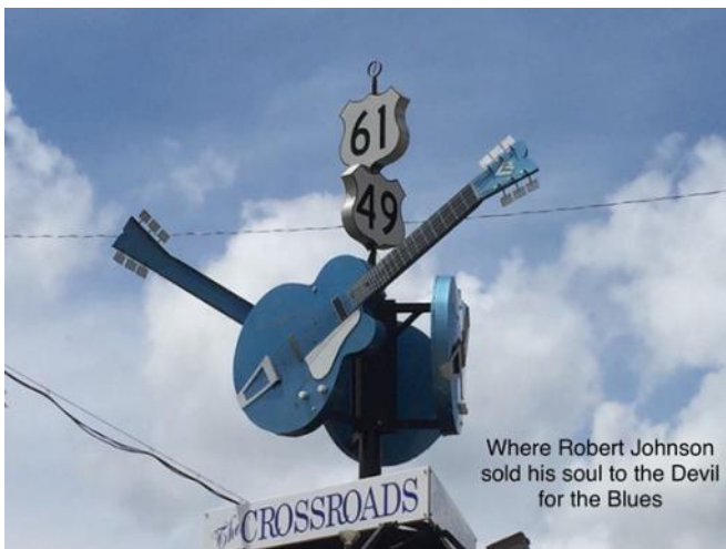
Where Robert Johnson sold his soul to the Devil for the Blues

Day 3 in Memphis took us to Clarksdale, MS, to visit the Delta Blues Museum. We had lunch at Abe’s BBQ, right at the crossroads of highways 49 and 61, where Robert Johnson is said to have sold his soul to the devil for the blues. Exhibits at the