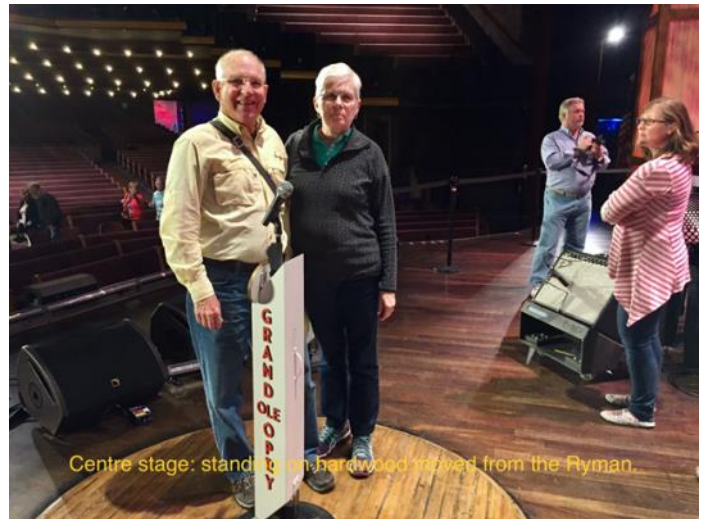
Centre stage: stand to an hardwood tabled from the Ryman.

Fast forward to 2016. We set off from the Airstream factory on April 1 and drove into spring on the way to Nashville. The following day, we did the backstage tour of the Opry. You do it at your own pace, with guides along the way, and get to visit all the dressing rooms (each with a distinctive decor) before