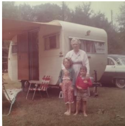
"This is how it all started. My Grandma, sister and me about 1960."

little storage space with all those rounded corners. I'm sure though that he didn't wish to tie up all that much money while trying to raise five kids on