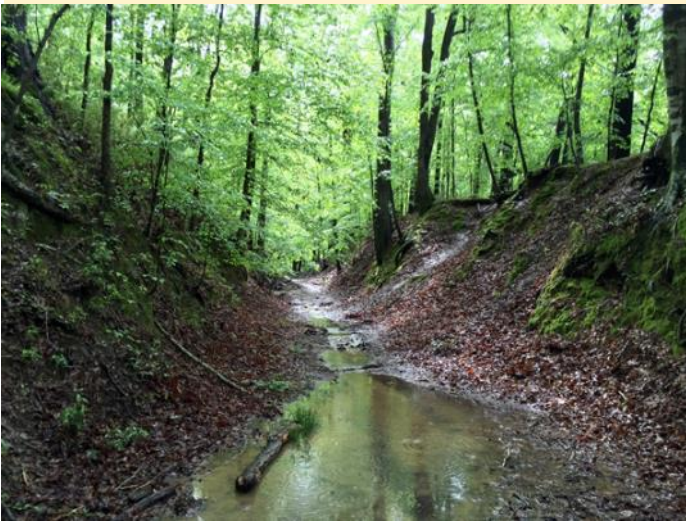
Part of the original Trace tropped down by thousands of travellers.

From Vicksburg we continued along the Trace back to Tupelo. On the way, we passed the highest point (603 feet). We had “done” the Natchez Trace from end to end!