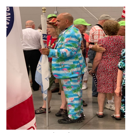
Now that's a suit!