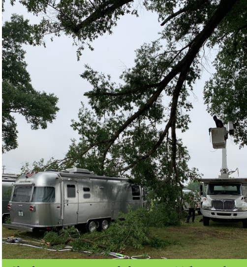
Shade was great until the storm! The trailer was damaged but no one was hurt. (not a GSL member, but our neighbor)