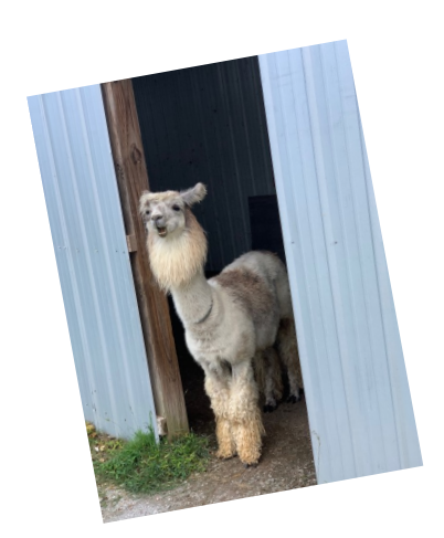
October 17-20.... It's Not Too Late...

Last call for our Installation rally in Litchfield, IL. Call Country Bend Campground at (217) 324-2363 to reserve your site. There are sites left in the park where our club is camping so you will be in the heart of the action!