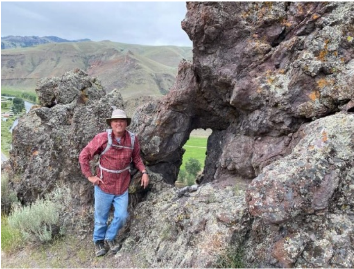
Hike in Elk Bend

all over Arizona with golf, tennis, pickle ball, heated pools and social activities to chase away the winter blues. If you aren't able to get away, winter is a great time to do maintenance and organizing in your rig. Remember to share tips and ideas in our newsletter! In addition to maintenance, care, and organizing, we welcome articles on your favorite camping spots, funny stories from "on the road", recipes and anything related to the Airstream life.