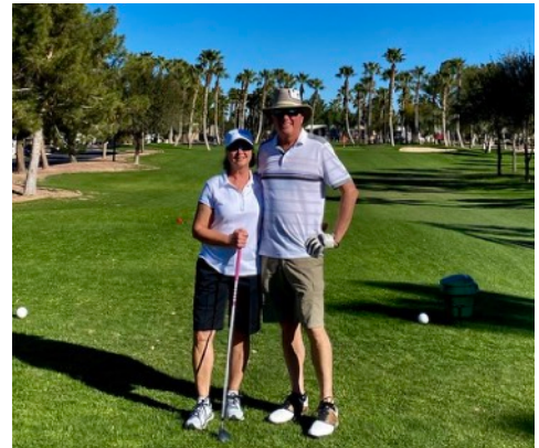
Golfing at Palm Creek

Happy 2021 Airstream-ers! I'm sure everyone was ready to say goodbye to 2020. We are all looking forward to getting COVID under control so we can get out traveling again without restrictions. This is a great time to do some trip planning since campgrounds aren't as busy. Check out our Rally Schedule (below and on the website) and decide which rallies you'd like to attend, then plan your other trips around those dates. Remember that National Parks and other popular places book up fast with more people camping so make reservations soon! If your Airstream isn't tucked away for the winter, there are great places to go this winter to get a change of scenery and warmer temps. We are going to Casa Grande, AZ for four weeks to take a big chunk out of winter. There are RV resorts