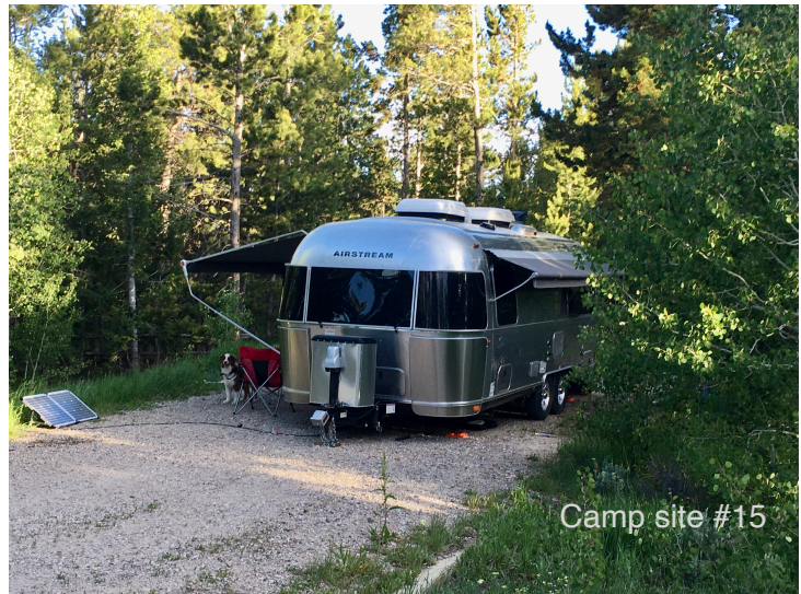
Camp site #15

Atlantic City Campground has 18 campsites and is in the South Pass area along the Main Fork of Crock Creek. The campground has vault toilets and water. Each campsite has a table, fire ring and grill. There are no hookups at this campground, but there are a few pull through campsites that can accommodate larger RVs. We stayed in #15 which was deep, roomy and beautifully wooded.