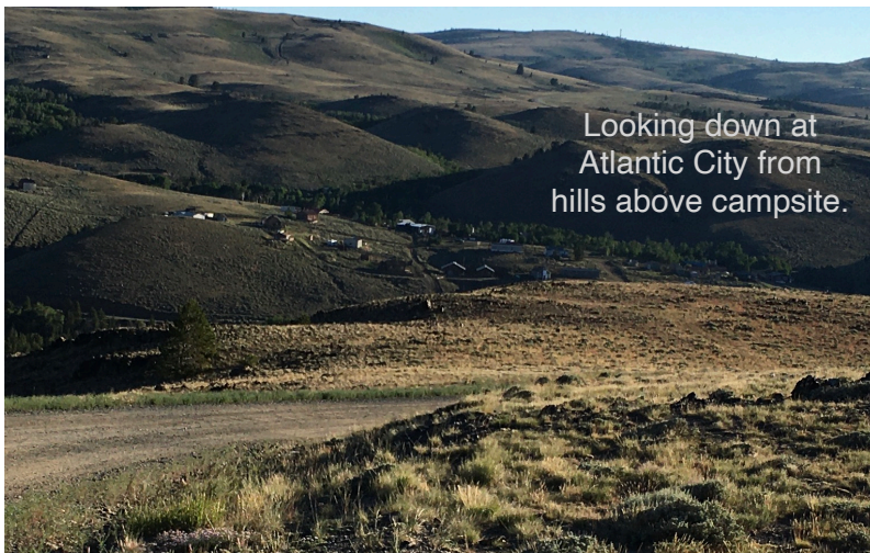
Looking down at Atlantic City from hills above campsite.

The area encourages hiking, biking, bird watching, fly fishing (which Keith did daily), historic sites and most other activities outdoor enthusiasts enjoy. One of the best things about this BLM campground is it is on a small, remote but paved road and the sites are very spacious with a large area between you and your neighbors. The bathrooms were cleaned daily with a power steamer. It felt like