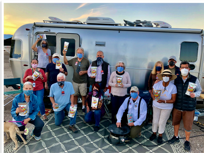
The gang's all here!