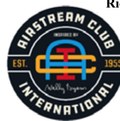
Airstream Club, Int'l

No matter which name you use There is only one Airstream...and one Airstream Club!